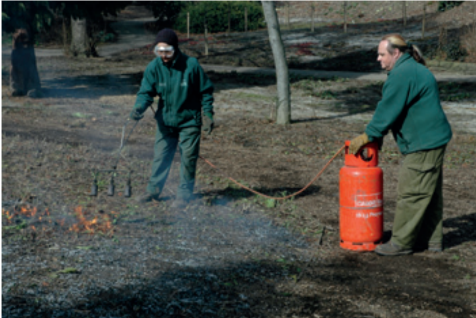
Fig. 9 Sheffield Botanical Gardens: Spring maintenance – controlled burning with a propane burner.

naturalistic herbaceous vegetation at minimum cost. As a result he mainly uses direct sowing with seed mixes that are carefully calibrated to create the desired aesthetic effect.