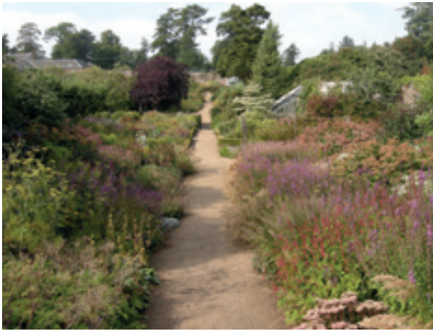
Fig. 3 Cambo Gardens: Double prairie border interpretations pictured in midsummer.