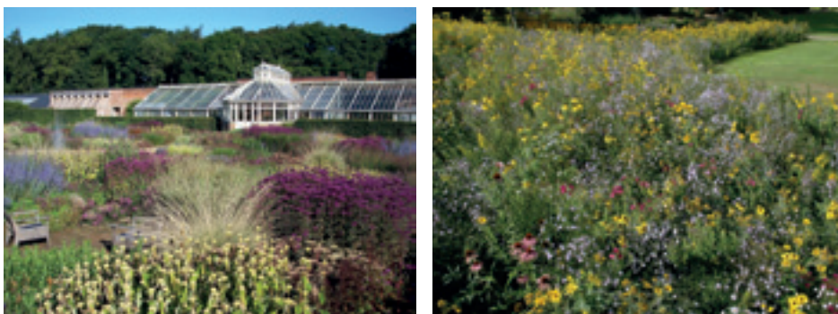
Fig. 10 Scampston: Perennial Meadow planting in midsummer.