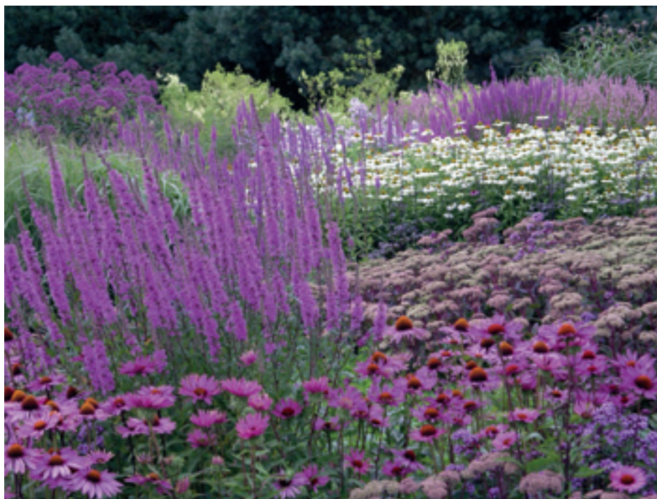
Fig. 7 Pensthorpe: Large colourful drifts in the Pensthorpe Millennium Garden.

Oudolf originally planted around 12,500 plants. The 2009/10 planting – which extends the season through the use of early-flowering forbs and bulbs and introduces a brighter colour scheme – added 6,000 plants but around one-third of the originals had already been lost. The design itself is quintessentially 'Oudolfesque' with large blocks or waves of signature plants such as Phlomis tuberosa 'Amazone', Persicaria amplexicaulis 'Firedance', Salvia verticillata 'Purple Rain', Lythrum virgatum and Eupatorium purpureum subsp. maculatum 'Atropurpureum'. Checketts describes it as a textural tapestry of colours and subtle structures (2010) (Figs 7 and 8). Planting density is around seven plants per square metre.