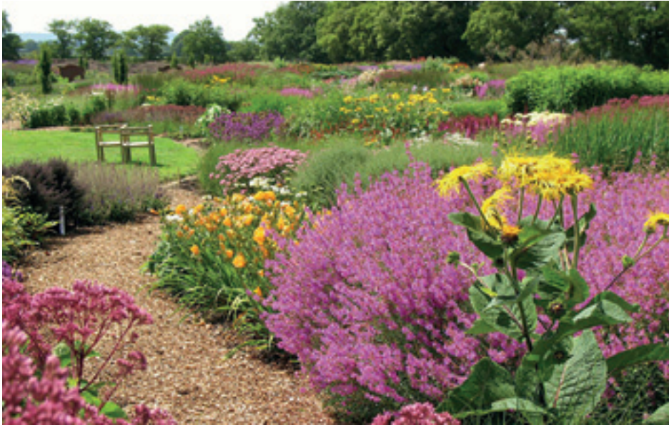
Fig. 12 Sussex Prairies: Borders in summer 2009 – just 15 months after planting.

A two-wheeled mower is used to cut the borders back in February. Plant material is left in situ and some borders are burnt. This works well in dry conditions. Around one-third of the beds will be mulched annually using green waste council compost. There is no feeding or staking.