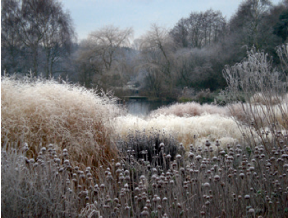
Fig. 8 Pensthorpe: Millennium Garden in midwinter – plants left standing as attractive features in their own right when covered with frost.

Checketts considers the planting to be reduced rather than low maintenance. There is no deadheading or feeding and very little irrigation. Some plants receive a ‘Chelsea Chop’. 7 The garden is strimmed in February and all plant material is removed. The low fertility provokes heavy flowering.