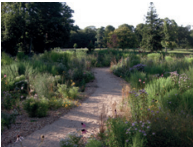
Figs 4 & 5 Cambo Gardens: New prairie planting in its second summer.