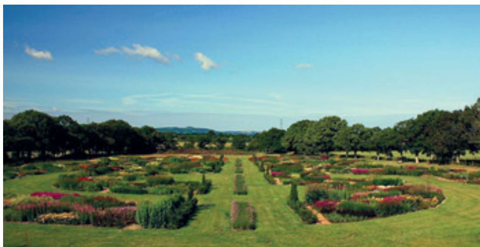
Fig. 11 Sussex Prairies: View of whole site.

Thirty-five thousand plants – propagated from plants at Altlorenscheuerhof, purchased in 9cm pots or grown from seed – were planted in May 2008 and established quickly. Photographs in Fig. 12 show it just 15 months later. The flowering season runs right through from May to November.