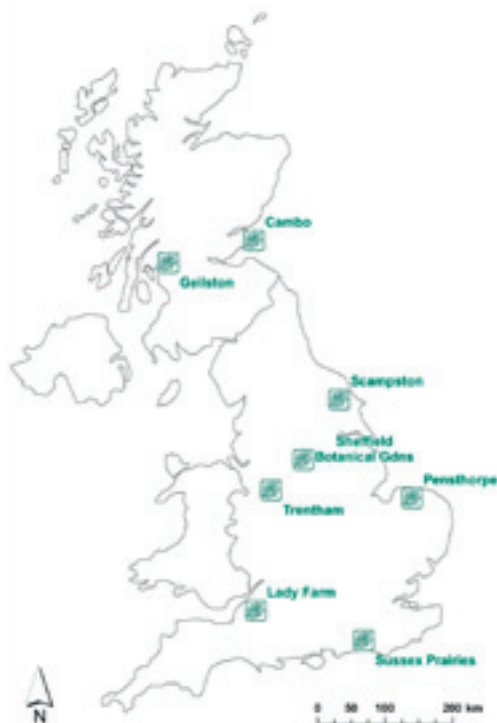
Fig. 2 Location of gardens visited as part of the research for this project.