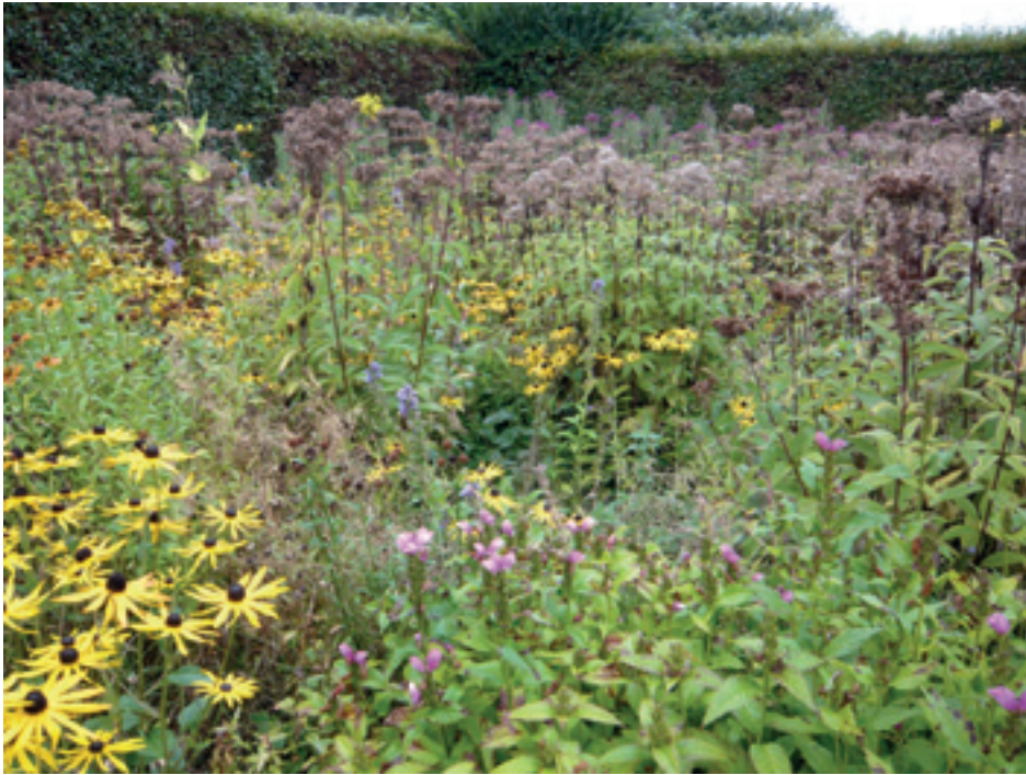
Fig. 6 Geilston: Small prairie border pictured in October – Rudbeckia and Eupatorium spp. dominate.