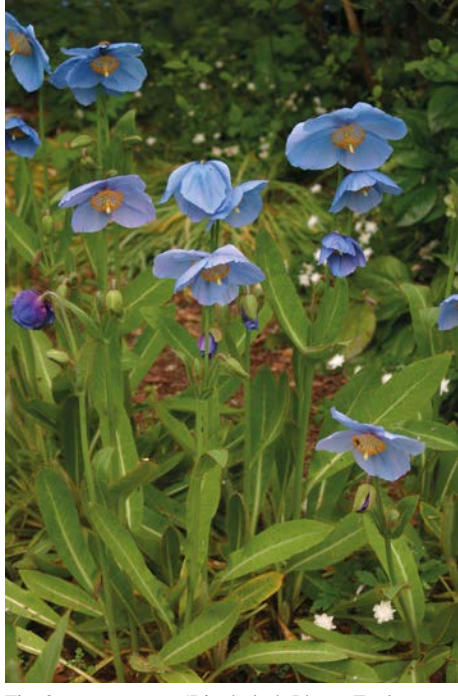
Fig. 2 Meconopsis 'Lingholm'.

In stark contrast to the inordinately long timescale of natural selection, the evolution of new species through polyploidy can be virtually instant, or take a very short time, although in some instances it may take some years, an example being the evolution of the hexaploid Meconopsis 'Lingholm' due to a time gap (see Figs 1, 2 & 3). Polyploids are also subjected to natural selection, like any other organism, so the two evolutionary processes can act together.