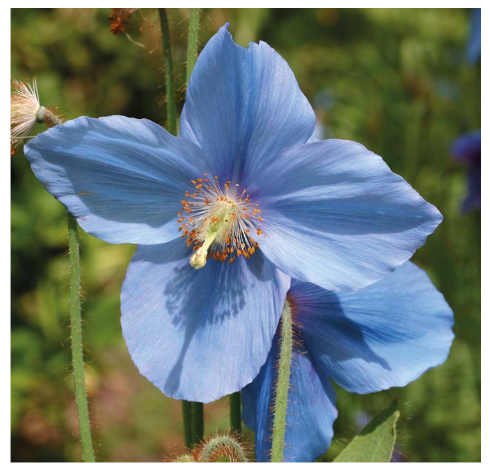
Fig. 4 Meconopsis 'Slieve Donard' flower.

In theory allotriploids could occur in the wild provided that the parental species are closely sympatric to allow cross-pollination. Triploid Meconopsis , involving M. baileyi and M. grandis , have never been located in the wild and are unlikely to be found because of geographical separation between these two species. All triploids, whether verified or putative, have been formed in cultivation, either arising naturally and spontaneously