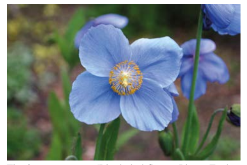
Fig. 3 Meconopsis 'Lingholm' flower.