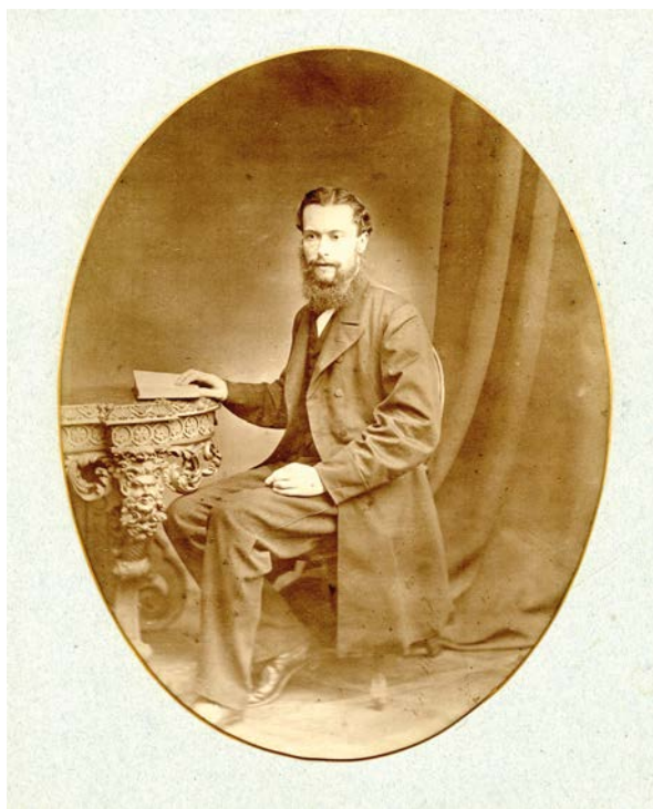
Fig. 5 Alexander Smith was the first Curator of Museum no. 1 in 1856.

predicated on Kew's usefulness to British commerce and the Empire. Alexander Smith, son of the first John Smith, became the first Curator of Museums (Fig. 5). He did not stay long in the post but it is notable that, as of 1856, all four of Hooker's Curators were Scottish.