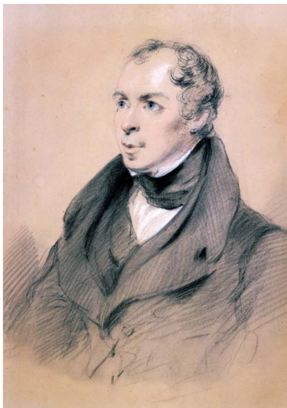
Fig. 7 Thomas Drummond, the first Curator of Belfast Botanic Garden and a plant collector in North America.