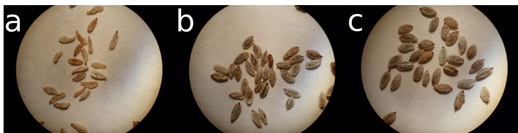
Fig. 1 Three categories of Euphrasia seed quality: (a) shrivelled; (b) intermediate; and (c) plump. The seeds are approximately 2 mm in length.

Euphrasia require a host for vigorous growth, and this requirement must be met within a few days of germination to ensure growth is not hindered (Wettstein, 1897; Yeo, 1961). Germinating Euphrasia seeds produce relatively large cotyledons and a robust hypocotyl, while the radicle is relatively small (Simpson, 1977). Root expansion occurs quickly, and there is notable root hair formation within a week. Euphrasia unable to find a host within the first two weeks often die, while some may remain small in stature above ground but develop an extensive below-ground root system questing for a host (Yeo, 1961). The choice of host species can have a dramatic influence on the survival of Euphrasia . For example, some fast-growing hosts that Euphrasia cannot attach to