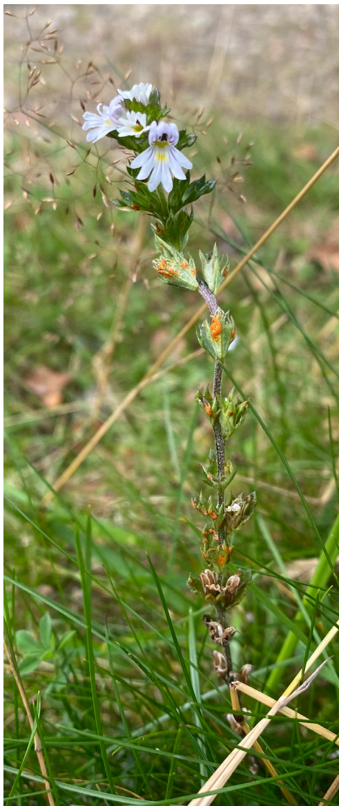
Fig. 3 Coleosporium sp. on Euphrasia (Pitlochry, Perthshire, UK, September 2020).

controlled laboratory conditions. For such studies, Euphrasia seeds can be readily germinated on moist filter paper under sterile conditions, using ethanol to sterilise petri dishes and seeds, and sealing the sterile dishes with tape to avoid contamination. Petri dishes should be maintained in a fridge at 4 °C until germination (no supplemental light