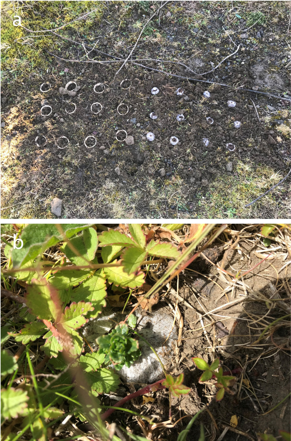
Fig. 6 Growing Euphrasia inside expandable 'Jiffy' pellets planted in a field site at Inverkeithing. (a) shows a planting array of pellets in the autumn, (b) shows an establishing seedling in the spring. After four months in the ground, the pellet's outer mesh showed no sign of decomposition.