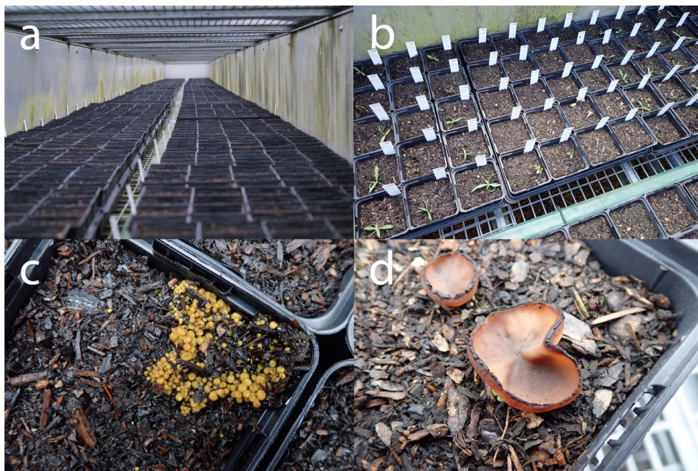
Fig. 4 Growth frames at the RBGE nursery used for Euphrasia germination and the Fair Isle Euphrasia experiment of Becher et al. (2020). Panels (a) and (b) show growth frame with pots in trays of 20. Panels (c) and (d) show fungal growth on the soil surface after waterlogging following the extremely wet spring of 2019.

connection between Euphrasia and the host. Host seeds were sown into trays filled with RGE1 potting mix in February. In April, we transplanted young host plants (< 2 weeks post-germination) into a pot containing Euphrasia . The transplanted individual is placed equidistant between the Euphrasia individual and one of the four corners of the pot. In common garden trials with many plants, this allowed us to keep a consistent distance between the Euphrasia and the host plant so there was no effect of distance to host. Placement of a host too close to the Euphrasia could lead to either very early attachment (which would be beneficial) or high levels of competition (which would be detrimental). Pots containing Euphrasia and host were then moved to their final growing conditions: the glasshouse or outside. During the course of the summer host plants had to be trimmed to avoid shading the Euphrasia