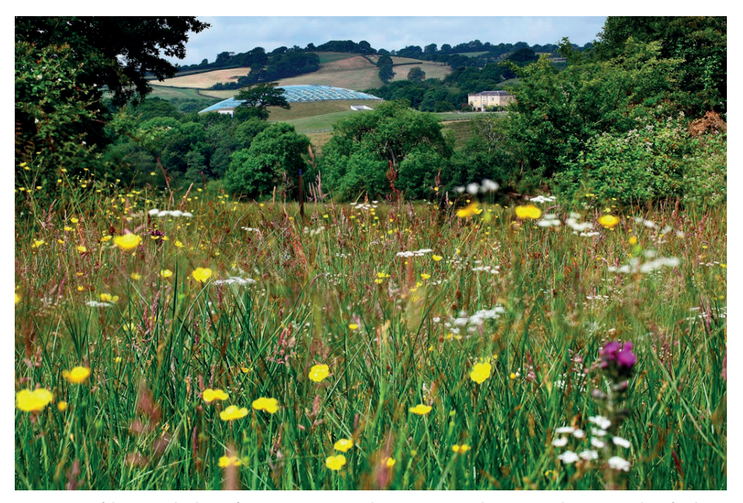
Fig. 4 Views of the Great Glasshouse from Waun Las National Nature Reserve.

could be illustrated by a series of generous donations. Specimens from the Royal Botanic Garden Edinburgh (RBGE) expeditions to Taiwan (1993 ETE), China (1993 KEG) and Chile (1996 ICE), for example, were notable early additions.