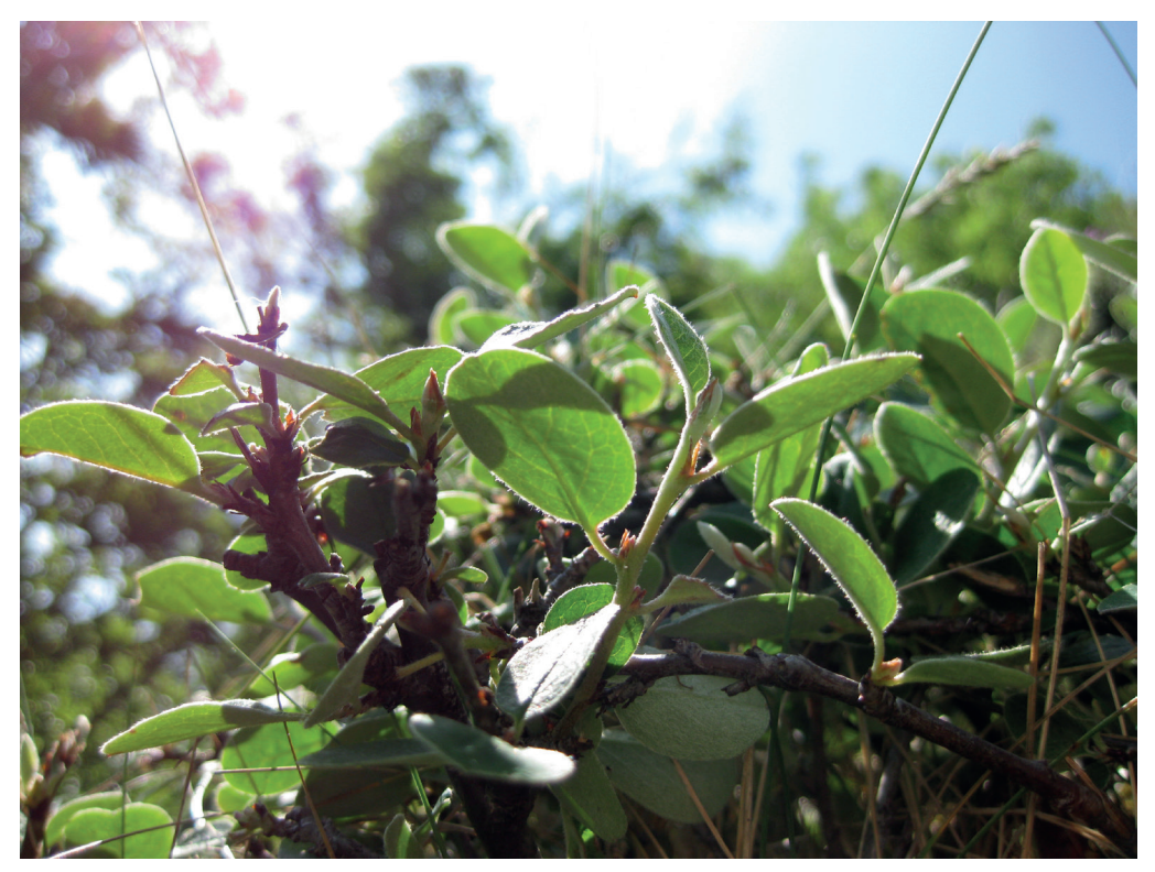
Fig. 5 Cotoneaster cambricus , a critically endangered species which is endemic to the Great Orme in North Wales and supported by ex situ collections held by the National Botanic Garden of Wales, Treborth Botanic Garden and FossilPlants.

In an age of increasing biodiversity loss and over 20 per cent of plant taxa facing extinction, the future development of the living collections must be focused and purposeful (Royal Botanic Gardens, Kew, 2016). Great progress has been made in conserving and celebrating Wales' plant diversity since the Botanic Garden opened, and the flora of Wales will continue to be a priority. Recent studies and the cultivation of Red List vascular species like Cotoneaster cambricus (Fig. 5), Sorbus leyana and Drymocallis rupestris have helped to protect vulnerable populations of rarities (Dines, 2008). Seed banking facilities have been developed parallel to an expanded cultivation programme to help safeguard the flora for future generations. Wales aims to be a 'globally