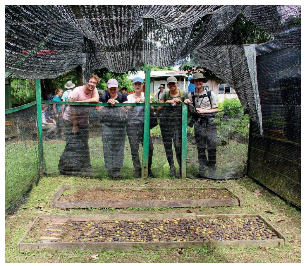
Fig. 6 Students from Aberystwyth University at a conservation tree nursery in Borneo, learning about conservation initiatives supported by the National Botanic Garden of Wales.

A recent joint expedition to Vietnam (2019) is an example of such an approach. Permitted and sustainable seed collections were made for ex situ cultivation at four UK botanic gardens, and new links were established with colleagues at the Institute for Ecological and Biological Resources in Hanoi. The next steps are further documentation and assessments, capacity building and the development of local ex situ sites for ecological restoration initiatives. Together with RBGE, Cambridge University Botanic Garden, BGCI, and Fauna and Flora International, we aim to continue with this work.