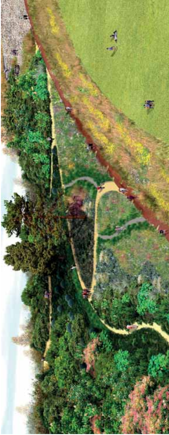
Fig. 2 The next step from drawing the design is the production of visualisations by landscape design consultants. Here a Gondwana landscape, reflecting the diversity and commonality of landscape typologies from Chile to South Africa to New Zealand, was planned at Wakehurst. Visualisation created by LDA Design.