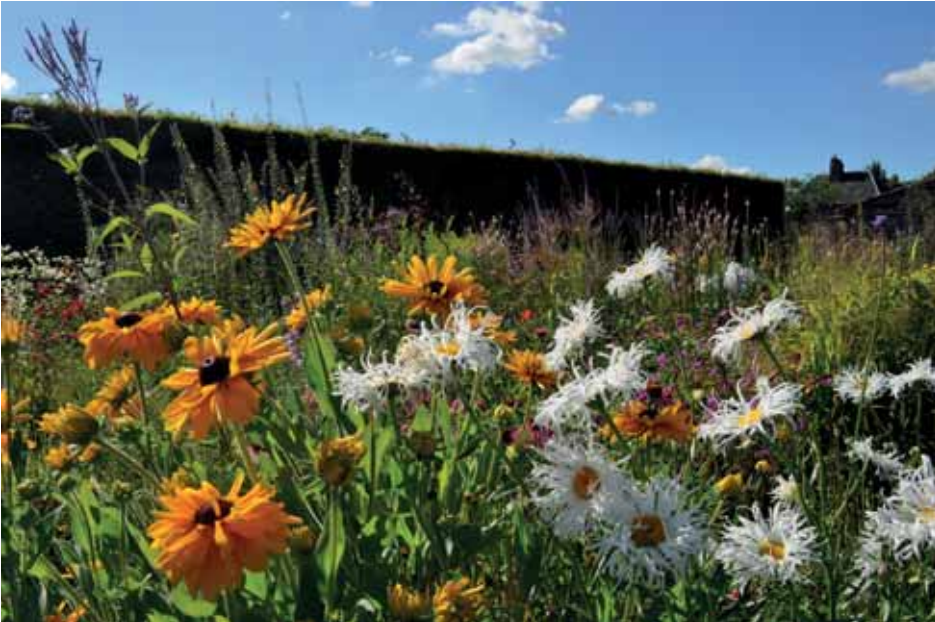
Fig. 3 Le Jardin Plume, Normandy, France: a soulful private garden reflecting the passions and lives of its owners.

Long-term planning provides direction for gardens, an effective framework with which to marshal resources, engage stakeholders and offer the horticultural team a purpose for their work beyond the cyclical patterns of the gardening year. Investing time and money into collaborative, externally facilitated plans can offer a panacea of authenticity and ambition, vision and values. If you've been asked to create a plan, don't see 'getting the consultants in' as the end of your ambitions, but a platform for the best ideas of you, and your team, to thrive.