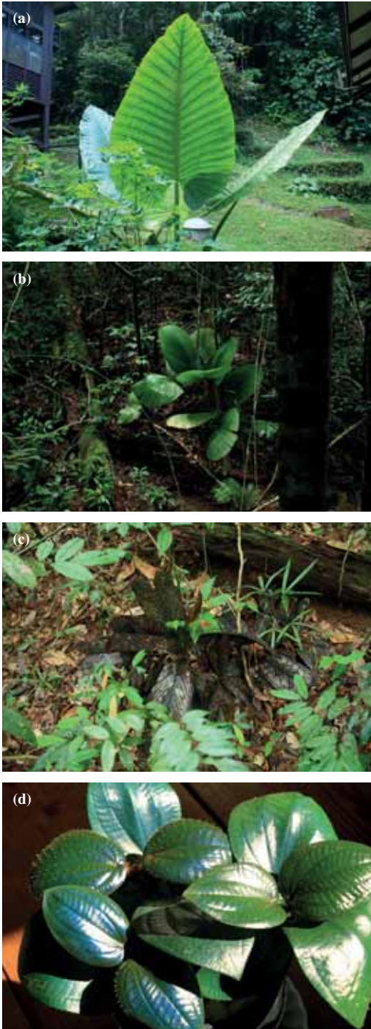
Fig. 1 Potentially exciting species for cultivation in botanic gardens worldwide that are constrained by being 'difficult' in conventional composts. (a) Alocasia robusta , an old plant growing at the Kuala Belalong Field Studies Centre, Brunei. Younger specimens can have leaf blades of over 2.75m 2 , but are almost never seen in cultivation. Success has been achieved with inorganic compost media. (b) Licuala orbicularis at Kubah National Park, Sarawak, is more common than its close relative L. cordata but still very rare in cultivation due to the high mortality rates of these slow-growing plants in conventional composts. (c) Pinanga veitchii is rarely cultivated despite its extraordinary brown camouflaged leaves. Success has been achieved by growing it in granitic (lime-free) sand and in deep shade. This wild plant is at the Kuala Belalong Field Studies Centre, Brunei. (d) Phyllagathis rotundifolia is an iridescent taxon from Peninsular Malaysia and Sumatra which goes blue in cultivation rather easily and should be grown more often. Inorganic compost media allow it to be watered frequently enough to keep it in good health without rotting the roots. This plant is in a rockwool and horticultural foam mix.