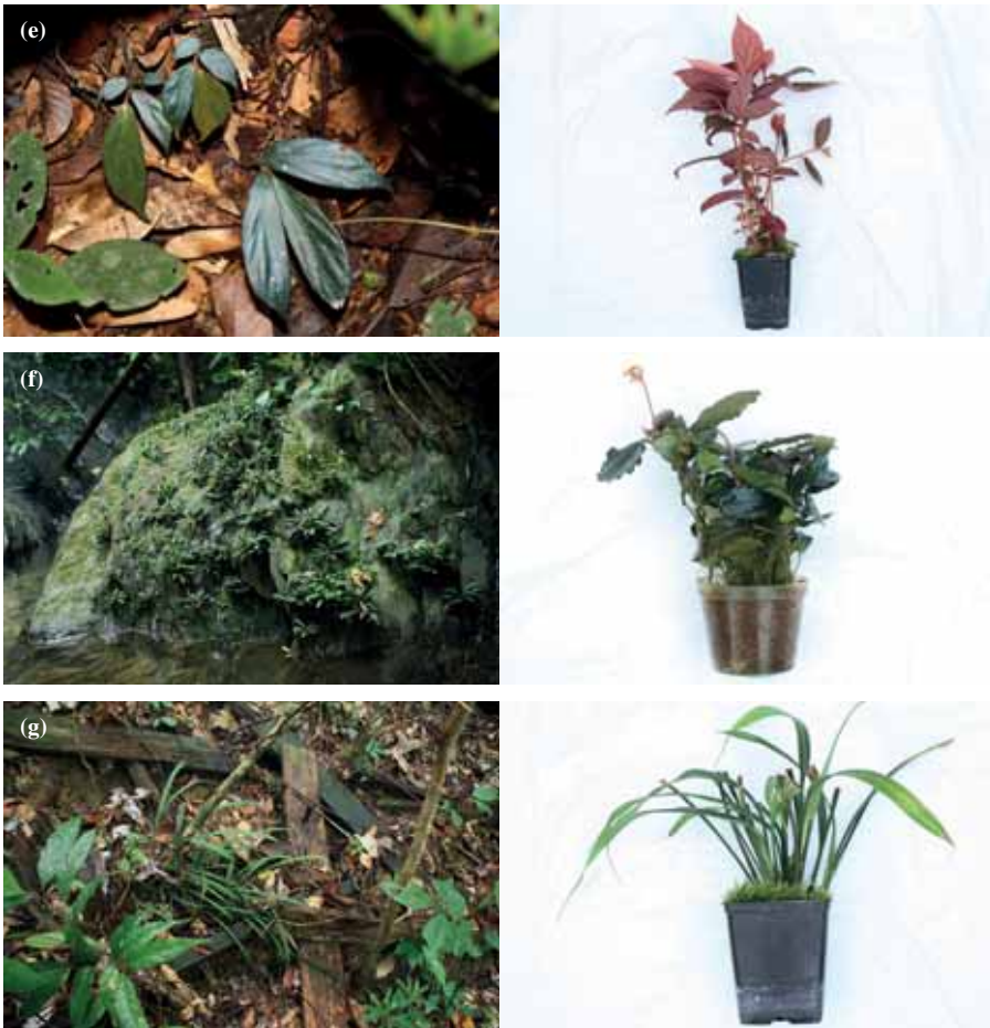
Fig. 2 (continued)

the ability to aggregate soil particles to improve drainage, regardless of soil type (Adams et al. , 2005). In addition, small pot plants are typically grown in media largely comprising lightweight organic material such as coir, peat and milled or composted bark. This is often because it is considered to be the best medium available, although cheap freight and ease of handling are perhaps of equal importance for the horticulture industry.