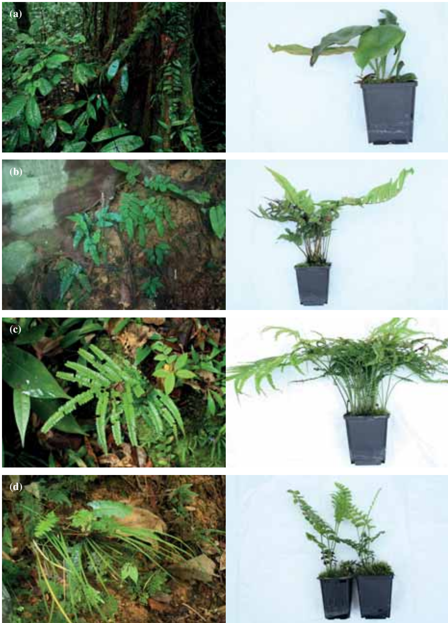
Fig. 2 Plants in the wild (left) and the same species growing in various inorganic media in cultivation (right). (a) Antrophyum callifolium , (b) Cyclopeltis crenata , (c) Lindsaea borneensis , (d) Lindsaea doryphora , (e) Begonia cyanescens , (f) Bucephalandra sp., (g) Mapania caudata . Note the visible clay under thin leaf litter with no humic horizon in (b), (d), (e) & (g). Plants have been regularly pruned to keep them small enough to accommodate in a near-closed plastic container, as well as being experimentally subjected to extended periods of near-fatally low light levels, hence the constrained growth and reduced sizes for many taxa.