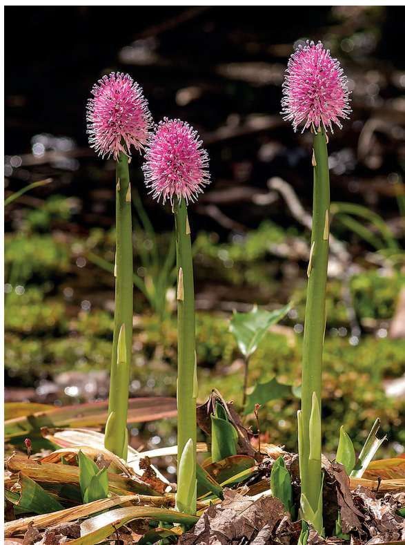
Fig. 2 Helonias bullata (Swamp pink) is a federally listed threatened species native to forested wetlands of the eastern USA. This species is locally abundant in the states of New Jersey, Delaware and Virginia. However small, isolated, high elevation bogs in the south-eastern USA have been shown to have populations that represent glacial refuges with higher levels of genetic diversity than other larger more northern populations.

restored bogs at six other locations in Georgia. During this time, the GPCA began to address conservation needs for a suite of rare species found in south-eastern mountain bogs, including Helonias bullata (swamp pink – Fig. 2) and Sarracenia oreophila (green pitcher plant – Fig. 3) among others. By 2012, survival rates for augmented mountain purple pitcher plants and swamp pink were 76 per cent and 88 per cent respectively, and the first seedling recruitment was documented for both species. By 2010, population genetic markers (microsatellites) were developed to assess the evolutionary impacts of restoring the mountain purple pitcher plant (Rogers et al. , 2010; Cruse-Sanders, in prep.). Representing more than two decades of conservation partnership, mountain bog restoration by the GPCA has been recognised as a model for successful plant conservation at regional and national levels.