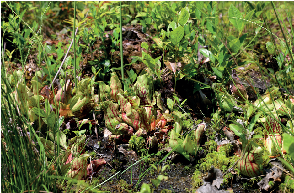
Fig. 1 Sarracenia purpurea var. montana at what was the last remaining mountain pitcher plant bog in Georgia on the Chattahoochee National Forest. This population started the conservation horticulture programme at the Atlanta Botanical Garden. Ex situ safeguarding and conservation efforts have led to the establishment of more than six restored mountain purple pitcher plant bogs with new seedling recruits.

For example, across the south-eastern USA mountain bog habitats have been reduced to less than 3 per cent of their original distribution and are of critical conservation concern. By the late 1980s, mountain bog populations in Georgia were limited to one remaining Sarracenia purpurea var. montana (mountain purple pitcher plant – Fig. 1) population with fewer than 20 plants in the National Forest. Using hand tools, chainsaws and eventually prescription fire, conservation partners within the GPCA restored microsites within the bog. At the same time the Atlanta Botanical Garden propagated the few remaining mountain purple pitcher plants, first by clonal propagation and later from seed once numbers in the wild had increased. Over the next two decades this material was used to augment the remaining bog and was introduced into