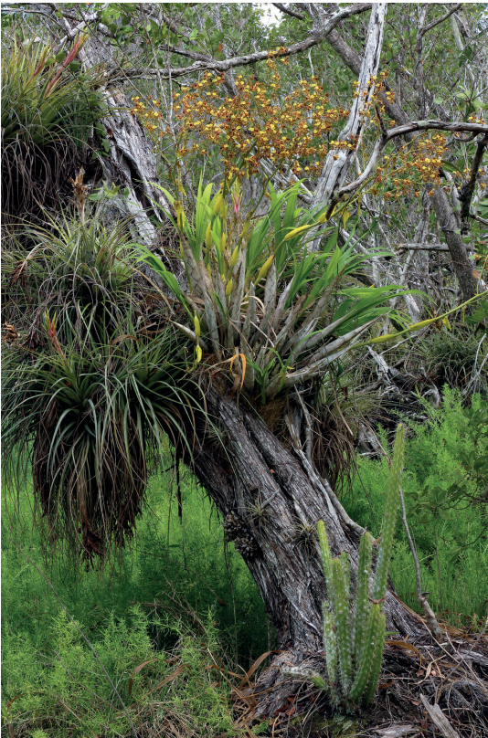
Fig. 6 Cyrtopodium punctatum (the cigar orchid) was down to only 19 known individual plants in the Fakahatchee Strand Preserve State Park, an area that became well known as the home of the ghost orchid in the publication The Orchid Thief . Since 2009, the Atlanta Botanical Garden has trained park staff, travelled for field surveys, propagated and grown orchids for restoration and monitored populations of the cigar orchid on the Park. Over several years more than 1,200 orchids have been outplanted in the park with more than 60 per cent survival rates.

In 2015, the Atlanta Botanical Garden was awarded funding from the National Fish and Wildlife Foundation and Gulf Environmental Benefit Fund for a project coordinated with the Florida Park Service. The Garden has partnered with the Florida Park Service for more than a decade to restore endangered species, such as the critically endangered Torreya taxifolia and the rare epiphytic orchid Cyrtopodium punctatum (Fig. 6). In this case the partners are working together to restore wetland communities (seepage slopes, wet prairies and stream side seeps) to re-establish the historical abundance, distribution and balance of native plant species and hydrologic flow that passes through the watershed of four coastal dune lakes along the Gulf of Mexico.