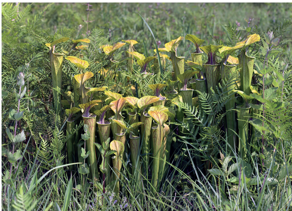
Fig. 3 Sarracenia oreophila is a federally listed endangered species endemic for the south-eastern USA. The species range is restricted to Alabama, Georgia and North Carolina. The greatest threats to this species are loss of habitat through development and wetland conversion to other uses.

and coordinate this effort with multiple state agencies and other partners. Many gardens make good partners for coordinating long-term efforts across multiple states because garden networks are well connected between academic, agency and private partners. As connections are built for information sharing, these networks become stronger through these initiatives.