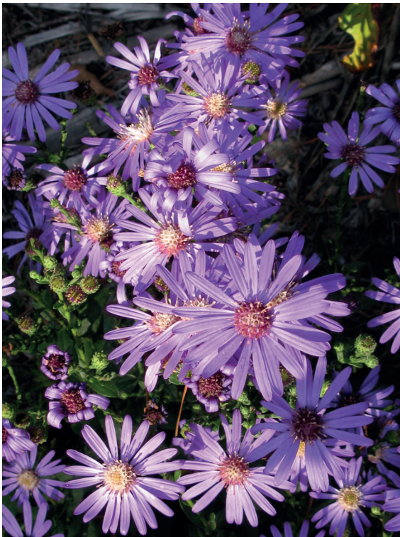
Fig. 5 The Candidate Conservation Agreement for Symphyotrichum georgianum (Georgia Aster) represents a broad scale conservation collaboration among federal, state, and private partners to work together for conservation of this species and management that will prevent its listing under the federal endangered species act.