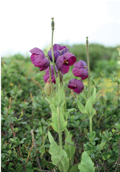
Fig. 3 Meconopsis gakyidiana with dark red flowers at Tsejong, Merak, east Bhutan, alt. 4,000m. Photo: T. Yoshida (2014), 2, vii.

we have chosen an epithet based on the Dzongkha word for happiness, gakyid , to reflect Bhutan's important cultural aspiration of 'gross national happiness'.