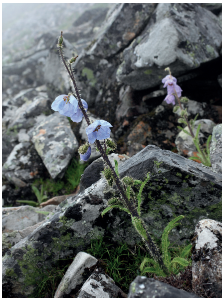
Fig. 7 Meconopsis merakensis var. merakensis , north-east of Tsejong, Merak, east Bhutan, alt. 4,350m.

We have selected Ludlow & Sherriff 659 as the type specimen of var. albolutea , because it is oldest of the available collections of this variety and shows the characters very well. This specimen was collected at Milakatong La located in the northern Tawang district, western Arunachal Pradesh of India, at 14,500ft (4,420m) elevation, and the flower colour is white according to the note on the specimen label. The living state of specimens with white flowers and sub-cylindrical fruit capsules can be visualised with the photos taken by Tim Lever at Pange La (south of Tse La) and Tse La in Mago district, which appeared in the Grey-Wilson monograph of the genus, pp. 263–264. The white-