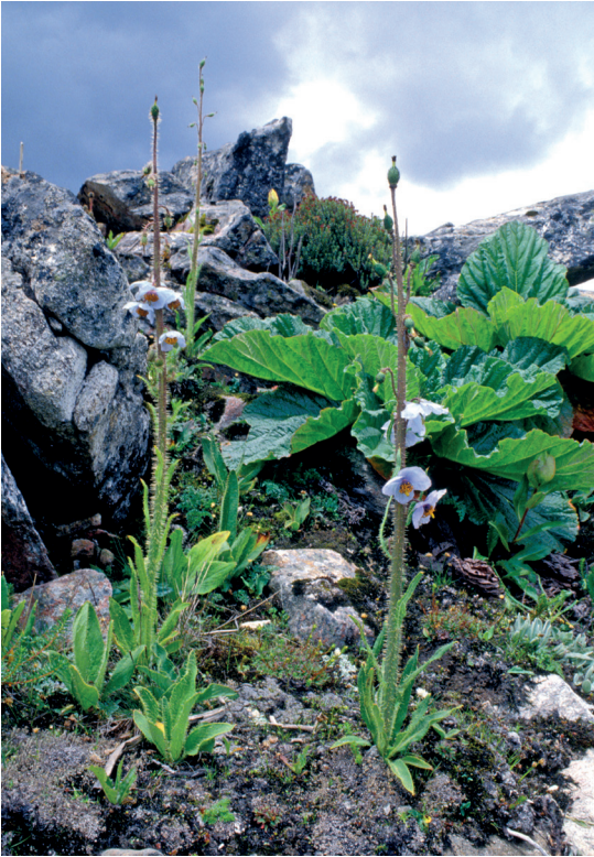
Fig. 6 Meconopsis prainiana var. prainiana at Serkyim La, Linzhi county, south-east Tibet, alt. 4,500m.