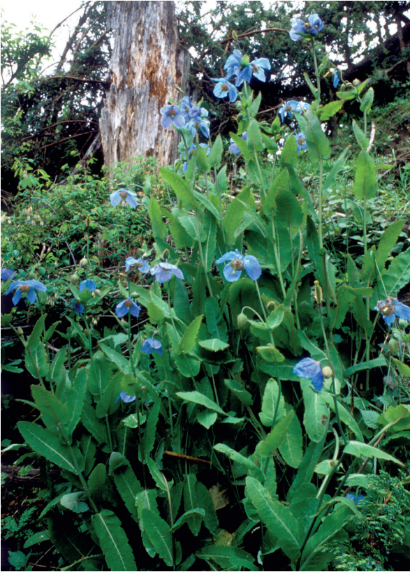
Fig. 5 Meconopsis baileyi , east of Tong La, Milin county, south-east Tibet, alt. 3,650m. Photo: T. Yoshida (1997), 26, vi.

pseudo-whorled bracts lower than the middle of the plant and often becomes completely scapose. The scapose-looking plants of M. grandis have sometimes been misidentified as a polycarpic form of M. simplicifolia with purple or deep-blue lateral-facing large flowers, or, as M. simplicifolia subsp. grandiflora Grey-Wilson, and vice versa; the last plant, growing in northern Bhutan and other regions, has been misidentified as M. grandis by some botanists.