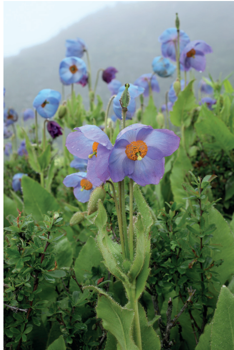
Fig. 1 Meconopsis gakyidiana at Tsejong, Merak, east Bhutan, alt. 4,000m.