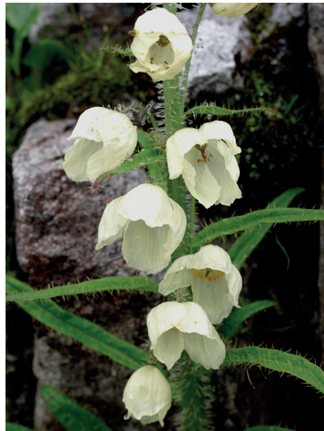
Fig. 12 Palest yellow flowers of Meconopsis merakensis var. albolutea at Bhangajang near Orka La, west Arunachal Pradesh, east India, alt. 4,100m. Photo: Takeo Morita (2014), 7, vii.