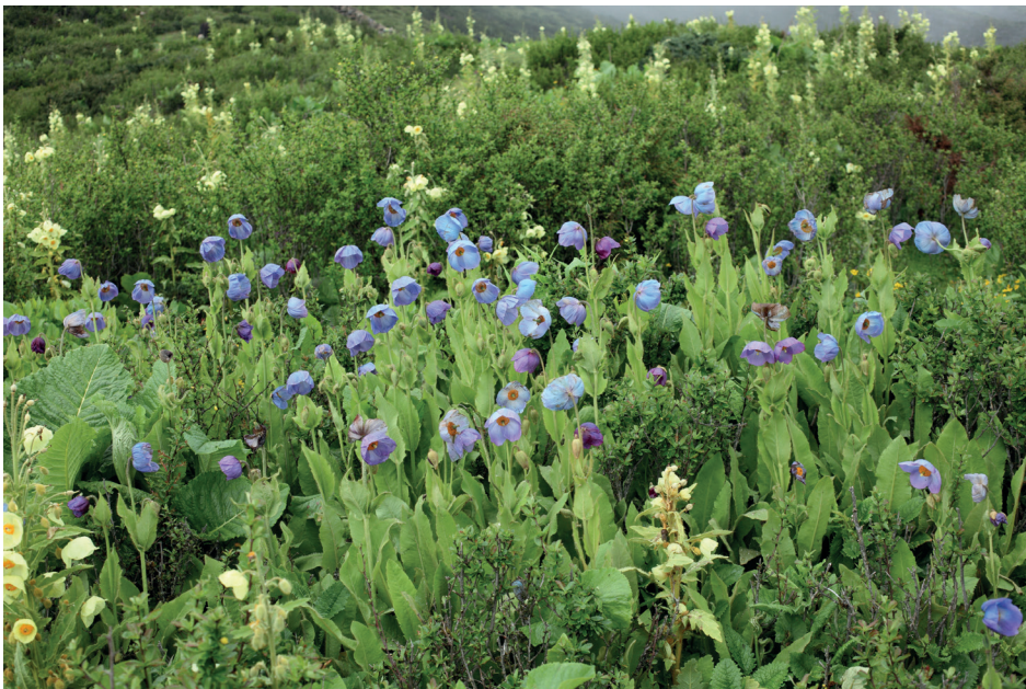
Fig. 2 Colony of Meconopsis gakyidiana , surrounded by yellow-flowered M. paniculata , at Tsejong, Merak, east Bhutan, alt. 4,000m. Photo: T. Yoshida (2014), 1, vii.