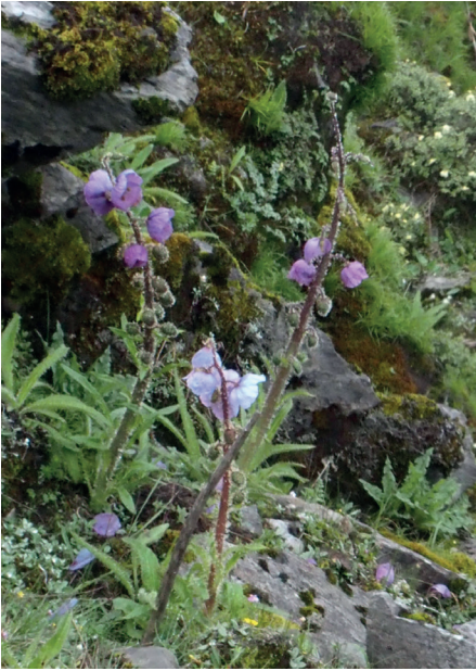
Fig. 9 Meconopsis merakensis var. merakensis , west of Orka La, Saktien, east Bhutan, alt. 3,950m. Photo: Setsuko Umezawa (2015), 12, vii.