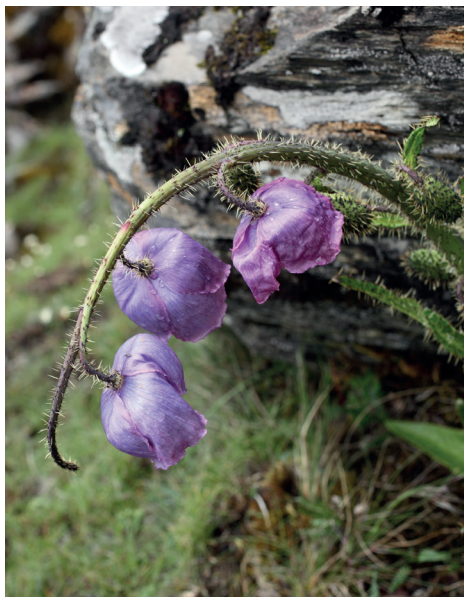
Fig. 8 Meconopsis merakensis var. merakensis with pale reddish-purple flowers born on curved rachis, north-east of Tsejong, Merak, east Bhutan, alt. 4,350m.