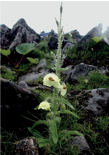
Fig. 11 Meconopsis merakensis var. albolutea at Orka La, Saktien, east Bhutan, alt. 4,200m. Photo: Shun Umezawa (2015), 10, vii.