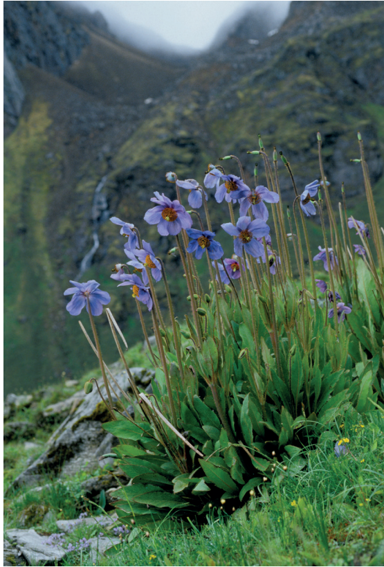
Fig. 4 Meconopsis grandis subsp. grandis in northern Jaljale Himal, east Nepal, alt. 4,450m. Photo: T. Yoshida (1990), 11, vii.

tolerate cattle trampling by forming substantial clumps with compact bases along with their hard and short rootstock. The sight of many plants with showy flowers scattered around the temporary houses could easily appear to foreigners as though the plants were cultivated.