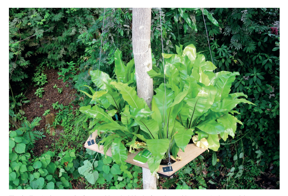
Fig. 6 Ten Asplenium nidus ferns positioned within the fernarium, with a green Agrisense sticky trap shown.

Each platform was equipped with an irrigation system connected to the biome's rainwater-fed reservoir (Fig. 8). To monitor the presence of invertebrates in and around