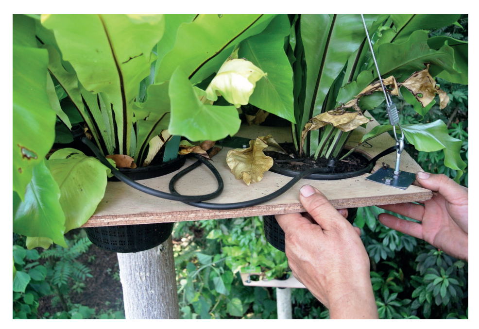
Fig. 8 Irrigation system which can be customised to deliver varying amounts of water and nutrients to simulate projected climate change scenarios.

was analysed using gas chromatography-mass spectrometry (GC-MS). The peaks displayed on the resulting chromatogram were identified as either bacterial or fungal as specified by Frostegård & Bååth (1996) and fungal:bacterial ratios were calculated for each fern.