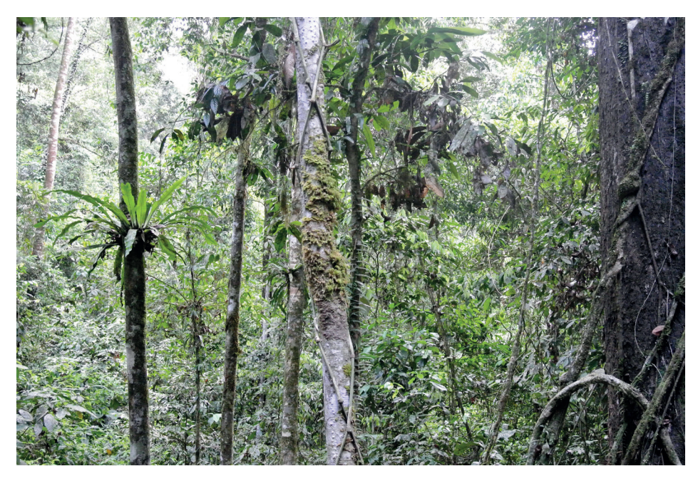
Fig. 3 An Asplenium phyllitidis fern in the lower rainforest canopy of the Danum Valley Conservation Area in Sabah, Malaysia.

a significant proportion of rainforest invertebrate biodiversity (Ellwood et al. , 2002; Ellwood & Foster, 2004; Dial et al. , 2006). In pristine rainforest the ferns are abundant at all heights, demonstrating their ability to survive the hot and dry conditions of the canopy, as well as the more humid conditions of the understorey (Fayle et al. , 2009). This tolerance for a wide range of physical conditions explains not only their prevalence in the tropical hothouses of many botanic gardens but also their popularity as ornamental plants in the landscaping of Southeast Asian cities such as Singapore.