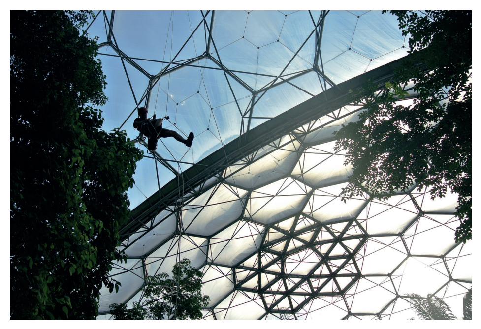
Fig. 2 Eden staff using rope access techniques within the Tropical Humid Biome.

The bird's nest fern ( Asplenium nidus ), found across much of tropical Asia and Australasia, is an epiphyte consisting of a rosette of upward-facing fronds, and a fibrous root mass, which anchors the fern to the host plant (Figs 3 & 4). The leaves trap falling litter which subsequently decomposes within the root mass, providing nutrients and moisture (Benzing, 1983; Turner et al. , 2007), and a microhabitat capable of supporting