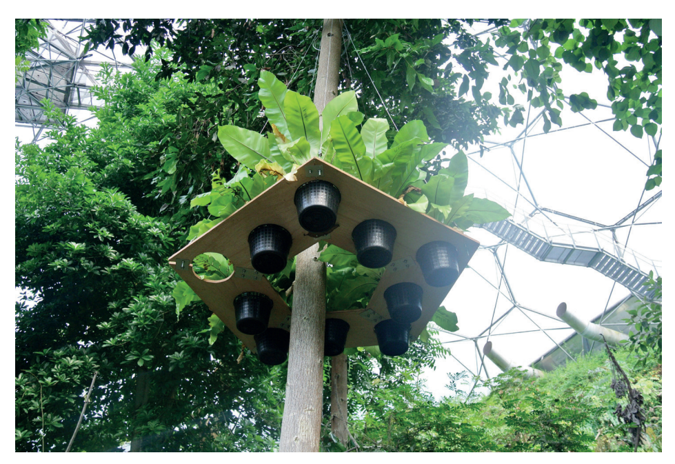
Fig. 7 Aquatic plant pots holding the fern roots and soil in place whilst allowing water through-flow that reflects natural plant conditions.

the ferns, three Agrisense pre-baited cockroach traps from Killgerm were attached at equidistant positions on each platform (Fig. 6). These were collected after one month, time enough to give a good insight into the movements of insects in and around the ferns. The tapered shape of the pots held each of the ten ferns in position without the need to fix them to the platform, hence the soil contained within these pots was easily sampled.