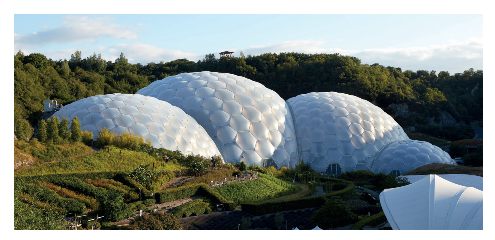
Fig. 1 The Eden Project outdoor gardens and two enclosed biomes. The Rainforest Biome is on the left.

The accessibility of the site for scientists and researchers, the assortment of tropical specimen plants growing under controlled conditions, and the functionally represent-