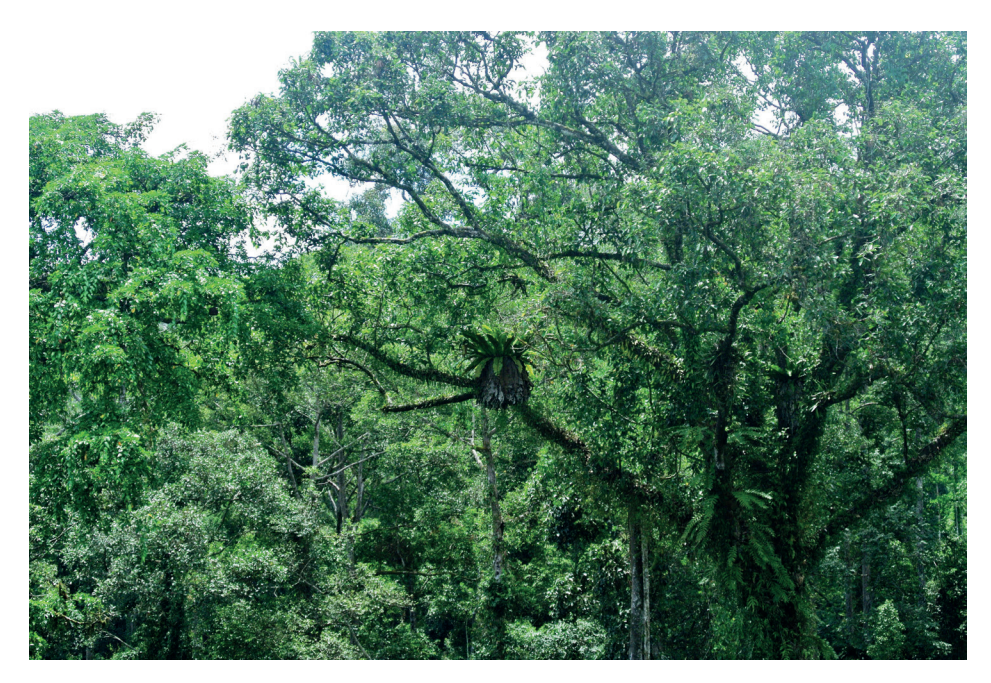
Fig. 4 A large Asplenium nidus fern approximately 50m above the ground in the Danum Valley Conservation Area in Sabah, Malaysia.