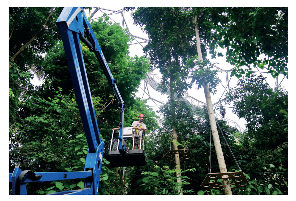
Fig. 5 Installing the fernarium using a cherry picker. The platforms are suspended around two Hopea odorata trees using galvanised steel wire attached to the roof.

The experiment required 20 bird's nest ferns, which were procured from Western Wholesale Plants Nursery in Chippenham, and, after spending three months in quarantine at the Watering Lane Nursery, were introduced to the biome. The ferns were transferred into aquatic plant pots 17cm in diameter. Unlike conventional plant pots, the aquatic pots maintained the through-flow of water and the exposure of the root ball to air as experienced by natural ferns, whilst holding the root and soil material in position.