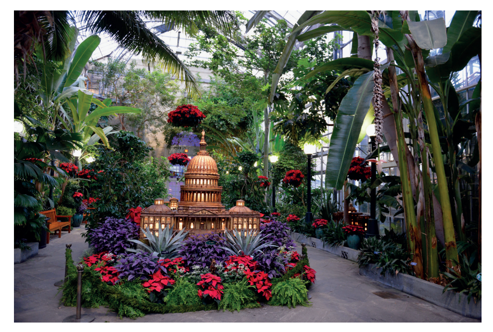
Fig. 11 The USBG during the annual holiday show. The model of the US Capitol shown here is made out of plant parts, mainly twigs, acorns, leaves and tendrils, and took more than 500 man hours to complete.

The USBG also combines its orchid collection with the Smithsonian Institution's orchid collection once a year, alternating exhibit sites. In odd-numbered years the Smithsonian hosts the orchid show, while the USBG hosts in even-numbered years. These two collections, when combined, represent one of the largest orchid collections in North America, with approximately 5,000 taxa. The USBG and Smithsonian have been