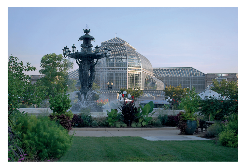
Fig. 7 The Bartholdi Fountain seen from the south end of Bartholdi Park looking north towards the USBG Conservatory.

Bartholdi Park is located just south of the Conservatory, across Independence Avenue. It is a triangular park managed by the USBG that connects the main block of the Garden to the American Veterans Disabled for Life Memorial immediately to the south. The Park contains a small Administration Building constructed in 1932 and is anchored by the monumental Fountain of Water and Light which was designed by French sculptor Frédéric Auguste Bartholdi and debuted in 1876 in Philadelphia before being moved to the US Botanic Garden in 1877. The Fountain was moved to its own park in 1932. Since then, the Park has focused on demonstrating the latest horticultural materials and techniques to the public at homeowner scales. The Bartholdi Fountain was completely restored in 2011 and the Park is currently undergoing its first full renovation since 1932. The new Bartholdi Park will open in the second half of 2016 with permanent plantings and interpretation to showcase sustainable horticulture techniques. This area will also include raised annual beds to facilitate programmes and education in accessible horticulture and horticultural therapy.