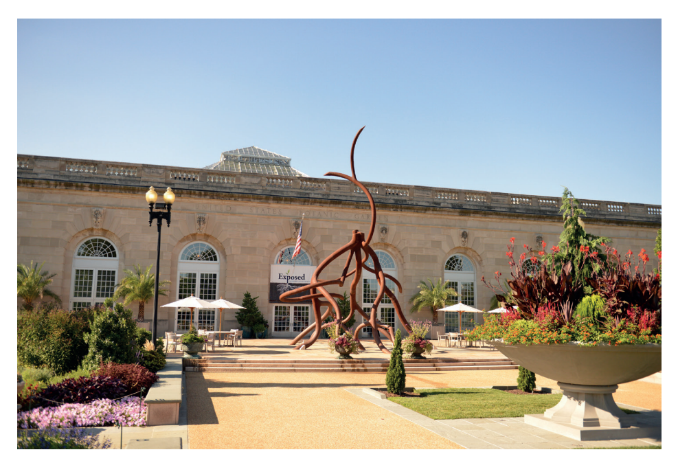
Fig. 14 The main entrance to the USBG in 2015 at the time of the exhibit, Exposed: The Secret Life of Roots . The monumental root sculpture by Pennsylvania artist Steve Tobin served to attract attention to the often overlooked, but critically important, subject of plant roots.

collaborating on this exhibit for over 25 years. The goal of the orchid exhibit is both to be visually stunning and to showcase the tremendous diversity of the orchid family, while highlighting the evolutionary forces that have led to orchid radiation and adaptation.