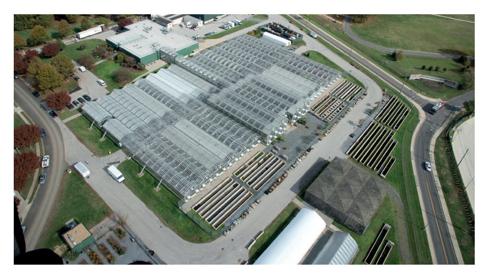
Fig. 8 Aerial photograph of the USBG Production Facility in south-eastern Washington, DC. This facility is located approximately 5 miles (8.05km) from the Conservatory. It houses the majority of the USBG collections and contains approximately 80,000 sq ft (7,432 sq. m) of greenhouse space.

The USBG accessioned plant collections number approximately 12,000, representing over 7,500 taxa. At any given moment the Garden is growing approximately 65,000 individual plants for collection or display. The major collections are Orchids, Medicinal Plants, Rare and Endangered Plants, Economic Plants, Carnivorous Plants, and Cacti and other Succulents. The Garden serves as a rescue centre for plants confiscated at US borders in accordance with the Convention on the International Trade in Endangered Species of Wild Fauna and Flora (CITES).