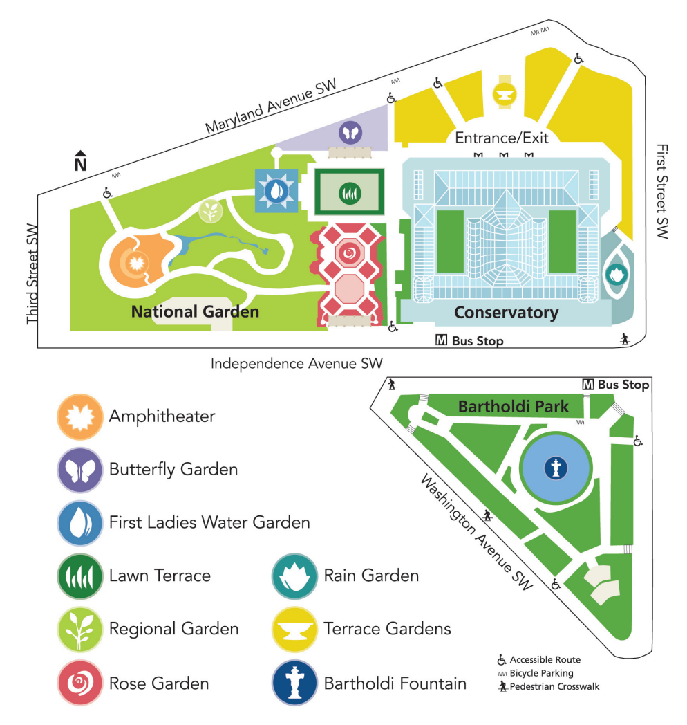
Fig. 3 The current configuration of the USBG with its three main elements: the Conservatory, National Garden and Bartholdi Park. This location is one block south of the original location of both the 1820 and 1850 gardens.

From the conception of the USBG by President George Washington in 1796 to its first incarnation in 1820, the establishment of its current plant collection in 1842 and first permanent greenhouse in 1850, the only constant at the institution has been change. Like any other institution, it has had its ups and downs but it has distinguished itself during an almost 200-year history through its dedication to providing an attractive space where