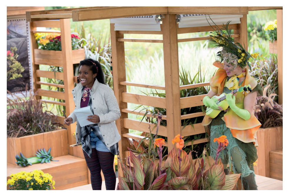
Fig. 17 A 2015 image from Flowers Stink , an original musical about a girl who discovers a passion for nature while completing a poetry assignment. The botanical education content of the musical was determined by the USBG and the play was specifically designed to be performed in the National Garden Amphitheater for local school groups.

The latter play was an interactive time-travel adventure that brought audiences through the USBG Conservatory looking for a mythical plant called the cerulean time capsule that possesses the secret to time travel. Through such partnerships, the USBG is able to work with non-traditional groups who help the Garden reach out to new audiences and leverage novel strategies, in this case theatre, to make plants more accessible to non-traditional audiences.