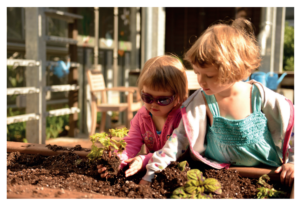
Fig. 15 Children planting in the USBG Children's Garden, which promotes active play with water, soil, plants and garden tools.

laboratory. As a part of the HOPS programme, the Garden also runs a teacher training institute, where teachers from around the country compete for slots to learn how to integrate hands-on plant science into their science curricula. Children's education programmes always prioritise hands-on activities and learning through experience, including opportunities for children to get their hands into the soil in the Children's Garden.