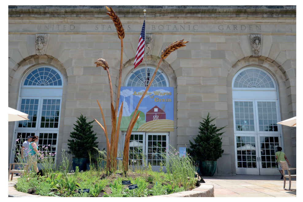
Fig. 13 The main entrance to the USBG in 2014 at the time of the exhibit, Amber Waves of Grain , which showcased the diversity, history and importance of the agronomic species wheat ( Triticum spp.). The bed in the display contains a wooden sculpture of awnless winter wheat surrounded by common agronomic weeds of temperate wheat fields. Agriculturally related displays have become increasingly effective ways of increasing the public's interest in plants.