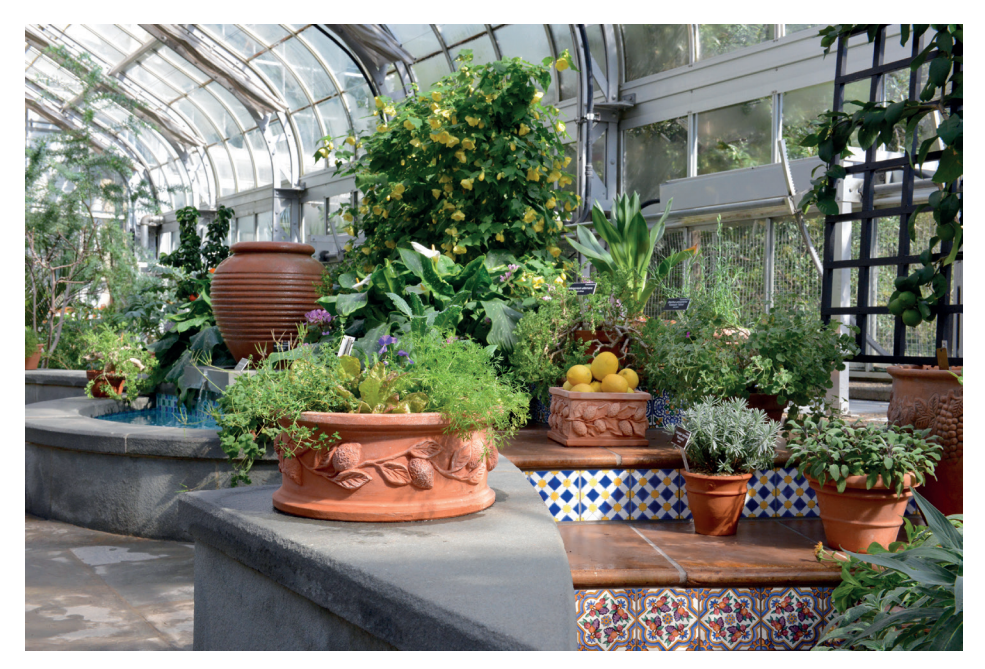
Fig. 10 The Mediterranean House in the USBG Conservatory. Plants native to the five Mediterranean climate regions of the world are grown alongside plants associated with the agriculture and horticulture of Mediterranean climates.