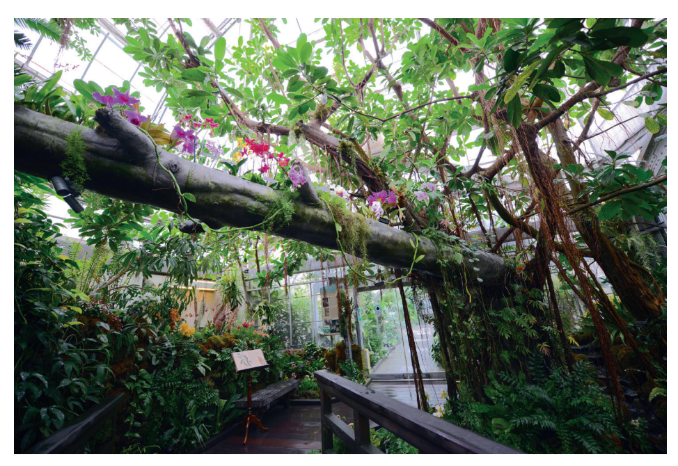
Fig. 12 The Orchid House in the USBG Conservatory.