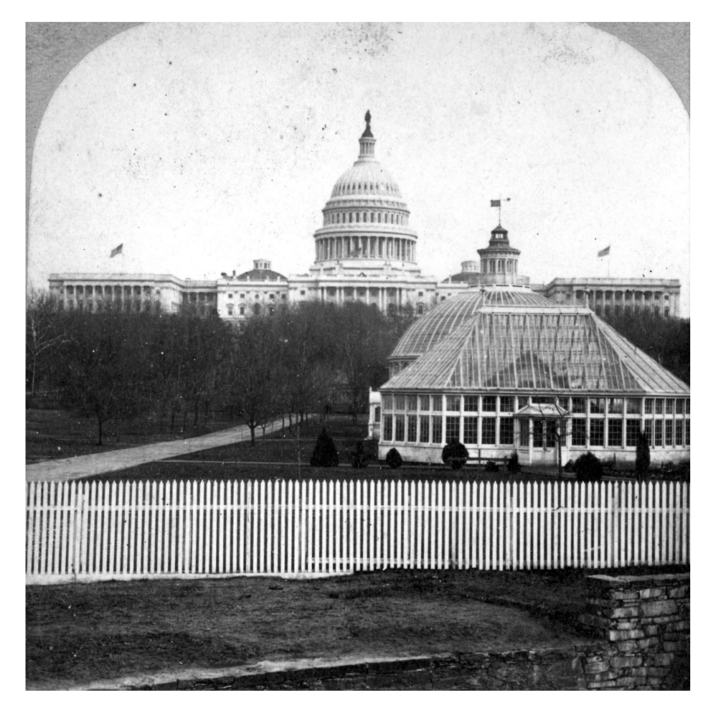
Fig. 2 The expanded USBG conservatory in 1887 in front of the completed US Capitol Building.

The plan for Washington, DC was originally entrusted to the French architect Pierre L'Enfant by George Washington in the late 18th century. However, by the late 19th century, many elements of the original L'Enfant plan had not been realised or had badly degraded, resulting in a capital city that in the eyes of its leaders did not live up