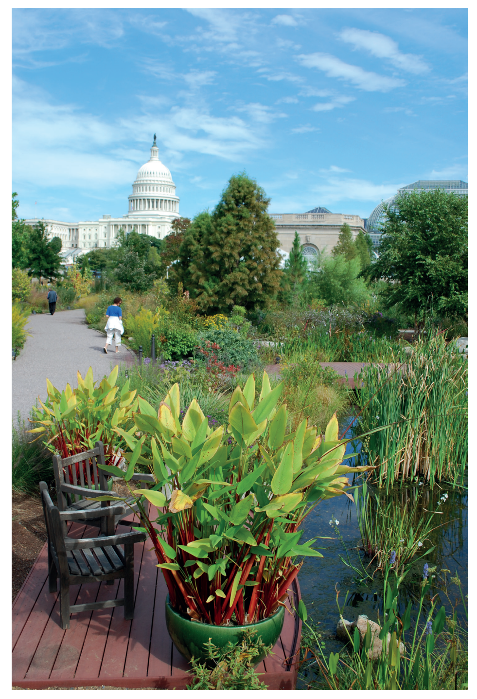
Fig. 6 The outdoor National Garden with the US Capitol in the background. This section of the National Garden focuses on plants native to the Mid-Atlantic US.