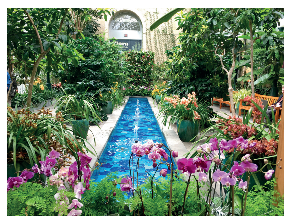
Fig. 5 The current configuration of the USBG Conservatory.

themed primarily to cultural uses of plants, specific taxonomic groups, biogeographical and ecological classifications. The largest room is the central Tropics house, which contains an eclectic version of a tropical rainforest, complete with a canopy walk to view the higher elevations of the forest. The Garden Court showcases economically important tropical and subtropical species important for food, construction, beverages, cosmetics, wood, spices and agriculture. There are also houses focusing specifically on non-flowering plants, Hawaiian endemic plants, medicinal plants, Mediterranean climate plants, cacti and succulents, orchids, and rare and endangered species. One of the greenhouse rooms is seasonal, currently displaying plants of US coastal dune and wetland communities. One of the courtyards is the Children's Garden, which provides a space for children to plant, water and play among plants. The second courtyard is a microclimate garden called Southern Exposure, where the protected nature of the courtyard allows a year-round display of plants from the southern United States that normally would not be cold-tolerant in an unprotected location in Washington, DC.