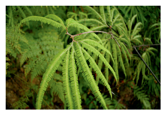
Fig. 5 Sticherus sp., a member of the family Gleicheniceae; collection ABEG 1.

specimen, be it seed, cutting or a herbarium specimen collected from the plant. A photograph is taken of the whole plant (Fig. 5), plus any distinguishing features such as flower, fruit, form, and so on. In some cases, a grey card will also be photographed. This is a simple technique used by professional photographers to achieve consistent exposures. In our case, Sadie Barber set the ISO and aperture of the camera and noted the adjustment in shutter speed to