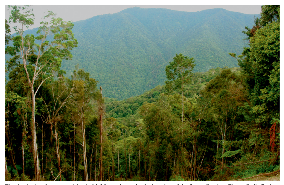
Fig. 4 A view from one of the Arfak Mountain roads; the location of the first collection.

sp. can only grow with mycorrhizal associations and so are difficult to grow from spores without a symbiotic culture. In these cases collections of living plants were made as oracles or sporelings. In the end a large proportion of our living collections were made as cuttings, seedlings, sporelings or rhizomes.