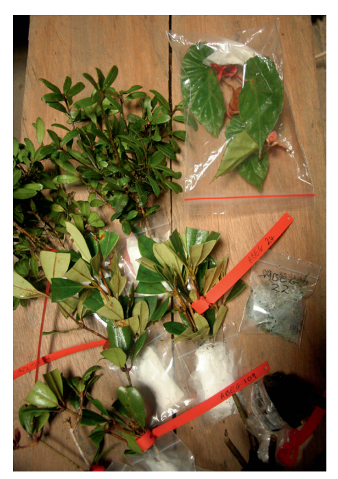
Fig. 13 Cuttings are prepared and labelled.