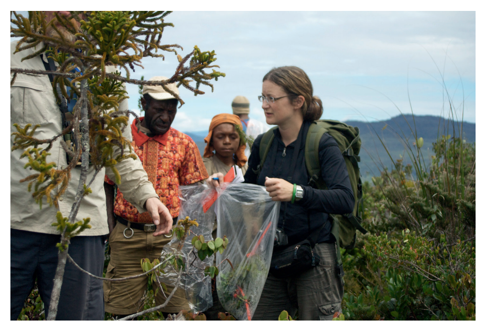
Fig. 11 Cuttings were labelled and placed in large plastic bags.

For collecting living material in the field we used large plastic bags and labels; the plant material was carefully carried in the bags and we took care not to lose the specimens' labels (rubber bands can be used to attach labels; Fig. 12).