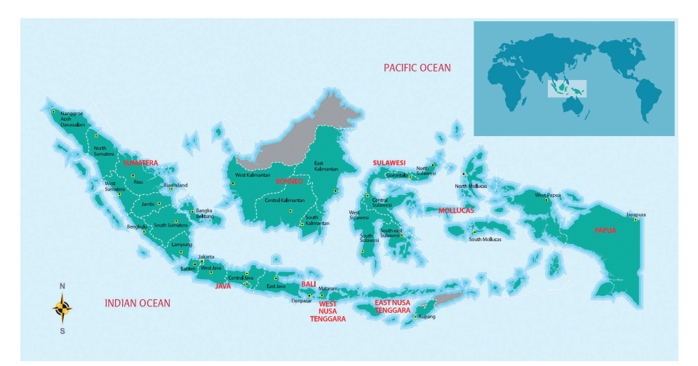
Fig. 1 Island groups that make up the country of Indonesia, with Papua to the east.

Papua – the western half of the island of New Guinea, and part of Indonesia (Fig. 1) – lies just south of the equator. It is the largest island in Indonesia (area of 41.48 million ha), with the lowest population in comparison to other islands of Indonesia. The province is dominated by tropical rainforest and, apart from at its highest elevations, the climate is hot and humid year-round.