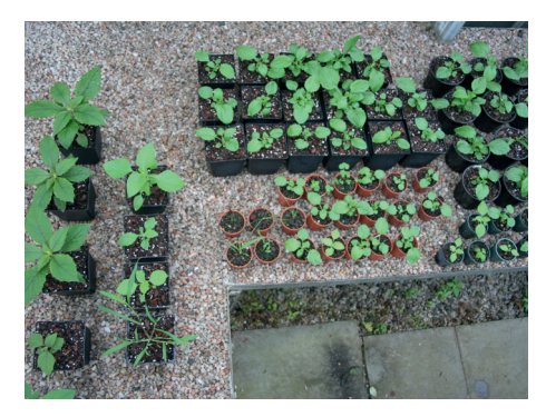
Fig. 18 Selection of higher plants germinated from seeds found in dry mud.

On our return to Edinburgh without our plants, in a fit of desperation we sowed the film of dry mud from leech socks, boots, backpacks and Thermarests<sup>®</sup>. From this, we were surprised to find a large germination of higher plants and ferns. We successfully germinated a total of six higher plant seeds (Fig. 18), including grasses, Asteraceae and Lamiaceae species, and spores of 19 fern species (Fig. 19).