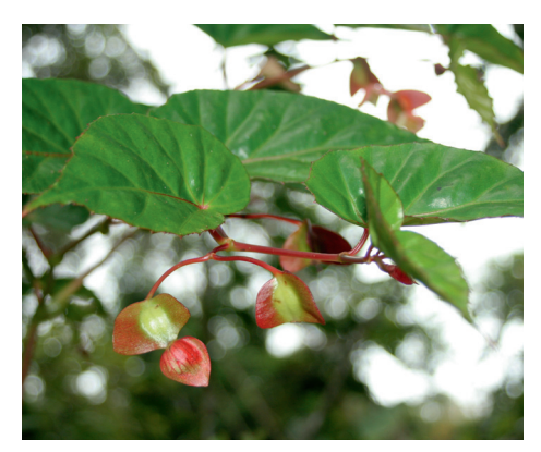
Fig. 8 Unripe seed pods of Begonia sp.