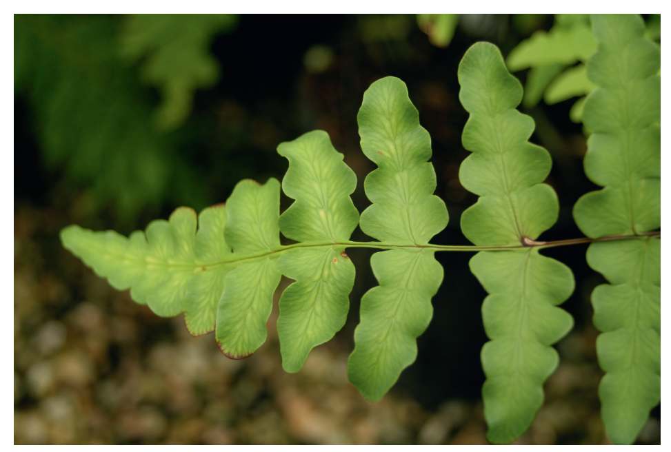
Fig. 22 One of the successfully germinated ferns Histiopteris incisa.

The seed and spore collections were all sown, although some of the fleshy seeds, many in family Zingiberaceae, had rotted and did not germinate. Most of the spores were successfully germinated (Fig. 22) but some with a much reduced percentage of germination. Those that have not germinated included those species belonging to the Gleicheniaceae family, suggesting that the spores of this family may be short-lived. A