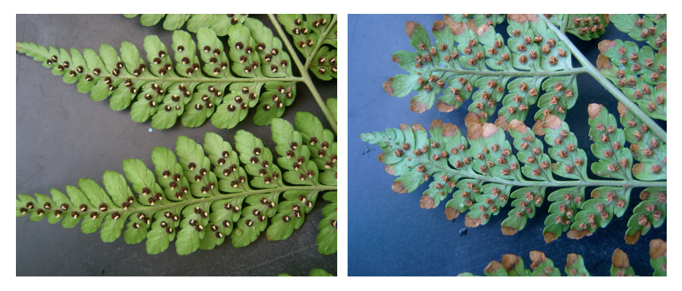
Fig. 10 Healthy, mature spores (1); spores have shed (r).

When collecting spores, it is important to be able to identify which material is ripe. Often, a fern frond has a range of spores present, from immature to ripe, or shed within the sporangia. Comparing them is often a good way to ascertain which are mature (Fig. 10). When no mature spores are obviously present, a collection of shed spore fronds can be made and usually some spores will be found trapped in the sporangia.