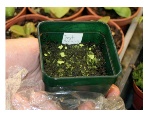
Fig. 19 Germination of ferns from spores found in dry mud.

It took two months for the plants to be released from Indonesia, and we asked staff at Cibodas Botanic Garden to rewrap the material and pack it all as we had done previously. With such a long delay we had expected the worst with regard to the health