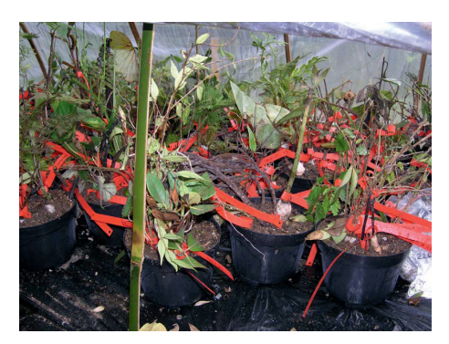
Fig. 17 Cuttings grouped together and potted in the cloche at Cibodas Botanic Garden.

On our return to Edinburgh without our plants, in a fit of desperation we sowed the film of dry mud from leech socks, boots, backpacks and Thermarests<sup>®</sup>. From this, we were surprised to find a large germination of higher plants and ferns. We successfully germinated a total of six higher plant seeds (Fig. 18), including grasses, Asteraceae and Lamiaceae species, and spores of 19 fern species (Fig. 19).