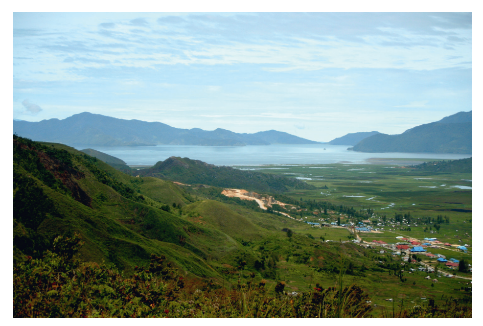
Fig. 3 Lake Paniai, the largest of the Wissel Lakes.