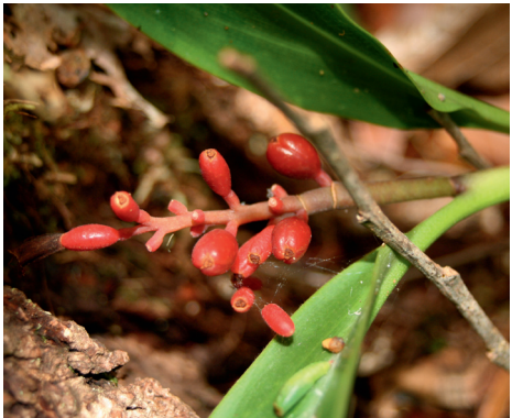
Fig. 9 Fleshy seeds of a Zingiberaceae collection.

When collecting spores, it is important to be able to identify which material is ripe. Often, a fern frond has a range of spores present, from immature to ripe, or shed within the sporangia. Comparing them is often a good way to ascertain which are mature (Fig. 10). When no mature spores are obviously present, a collection of shed spore fronds can be made and usually some spores will be found trapped in the sporangia.