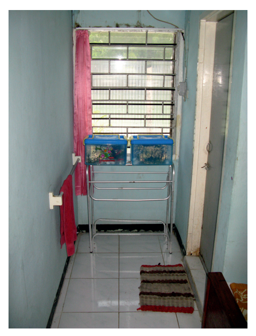
Fig. 15 The rice boxes, kept in the shade and under air-conditioning.

A total of 330 plants were collected. Some of these plants were collected as multiple specimens (herbarium and living) and the final numbers are shown in Table 1: