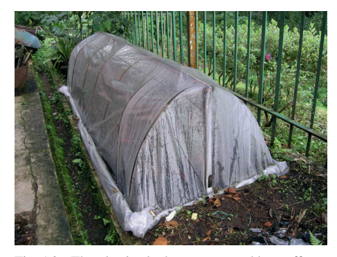
Fig. 16 The plastic cloche, constructed by staff at Cibodas Botanic Garden, following our design.

We had no choice but to leave our spore and seed packets in an air-conditioned office at Bogor Botanic Garden which lies 80km south of Jakarta and instruct staff at the Cibodas Botanic Garden, which lies 120km south of Jakarta, to build a polythene cloche (Fig. 16) to house all of our cuttings, seedlings and rhizomes. The plants were potted up with their labels (bunches of cuttings were kept together). They were sprayed and the soil kept moist (Fig. 17).