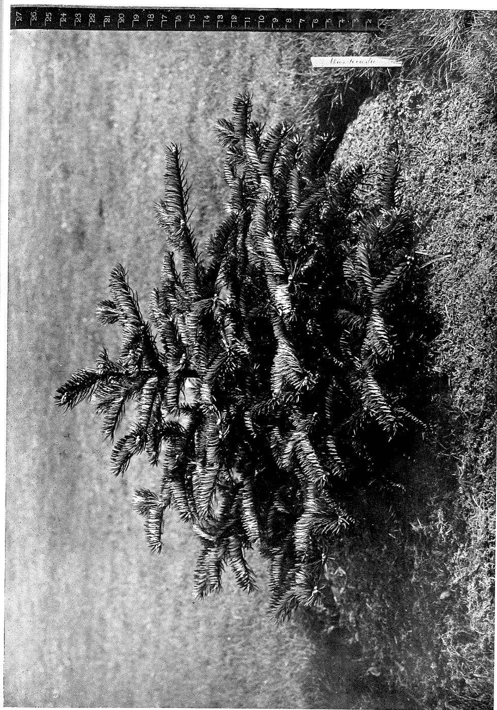
ABIES FORRESTII, CRAIB.