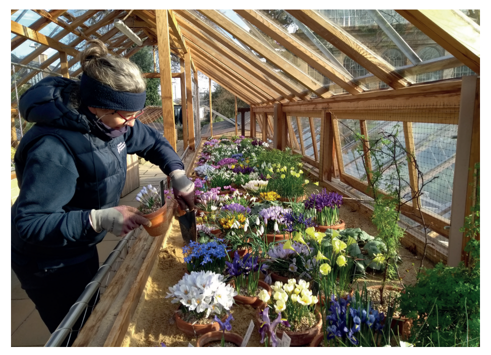
Fig. 1 Plunging pots in the spring bulb display in the Traditional Alpine House.

to each other without touching. Close proximity to each other aids bulb growth as well as providing a good display. The pots are top-dressed with a layer of hen grit 1 cm thick, which helps to conserve moisture. Pots are then plunged to the pot rim in sand bays. Sand bays provide a cool, damp but free-draining substrate for the bulbs, protecting them