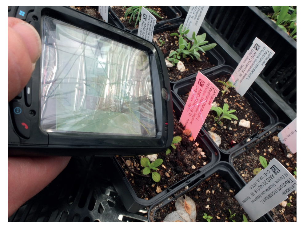
Fig. 2 Stocktaking plants in the nursery using a PDA with 2D scanner.

The second application was in mass plantings. To avoid soil exhaustion, many of the perennials in a garden area with 18 subsections were lifted in 2015 and moved to another subsection. The total inventory of the larger area did not need to change, but most of the inventories of the subsections were going to be completely different. To update the inventories after the reshuffle, a new list of plants in each subsection was composed using the mobile software on the PDA with integrated 2D barcode scanner. The resulting lists were used to analyse which plants were new to a subsection and which were still in their initial location. A number of the labels in the area had not yet been provided with a barcode. For these plants, information had to be typed in by hand, which caused a significant delay compared to the machine-readable labels. With the Living Collection available online for visitors to explore, being more up to date with the inventory now improves the online experience and enhances the profile of the Garden.