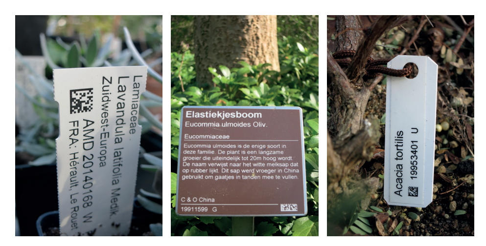
Fig. 1 (left to right) Nursery label, interpretation label and accession tag with Data Matrix codes containing the eight-digit accession number.

collection management software with the scanner hardware. Once this had been done we had a mobile version of the software running on a PDA that could instantly pick up tiny DM codes and pull up the record linked to it. The mobile collection software was redesigned to support three workflows using barcodes, as follows: