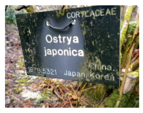
Fig. 4 Label showing the effects of copper leaching and run-off from weathered wire at Dawyck Botanic Garden.

Where the copper wire was discoloured through ageing, bleaching or lightening of the black display label was noticeable around the attachment points and below on the tag face (see Fig. 4).