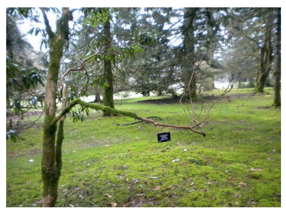
Fig. 1 A healthy specimen of Rhododendron irroratum at Benmore Botanic Garden with one dead branch on which the label is attached.

growth, it has been proven to cause chronic poor health in woody ornamental species at solution levels above only 1ppm (Kuhns & Sydnor, 1976).