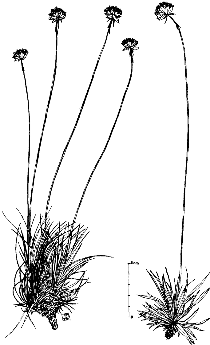
FIG. 1. Armeria aspromontana Brullo, Scelsi & Spampinato: left, old plant; right, young plant.

wide. Outer involucral bracts ovate-triangular to linear-subulate, 5.5–20mm long, \pm long cuspidate, slightly scarious beneath; inner involucral bracts subrounded to oblong, 6–8mm long, 3.5–6mm wide, shortly apiculate or cuspidate at the apex, with scarious and undulate margin, up to 1.5mm wide. Spikelets 2–3-flowered, subsessile with outer bracts hyaline-scarious, obovate-cuneate, 7–9mm long, 6–7mm wide, 1–2(–3)-nerved; inner bracts hyaline, cuneate to oblong, 3.5–5mm long, 3–3.5mm wide, shortly 1-nerved. Calyx 6–7mm long, hirsute on tube and ribs with hairs