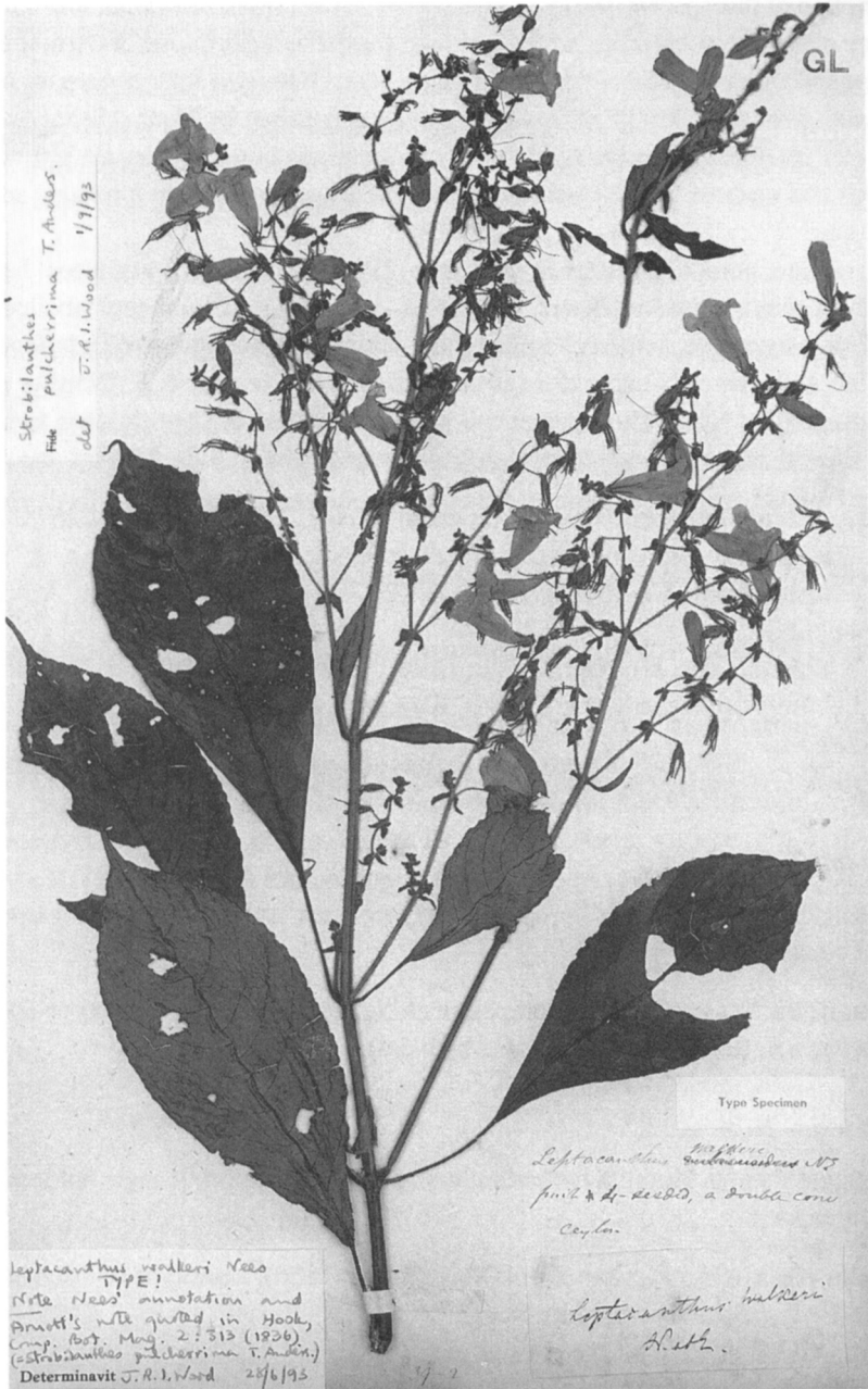
FIG. 3. Type of Leptacanthus walkeri Nees showing Nees' own annotation (bottom right) and Arnott's label, corrected from rubicundus to walkeri presumably after Nees examined the sheets. Note also the phrase about the fruit added by Arnott to the paper by Nees (p. 312), presumably based on the capsule (top right).