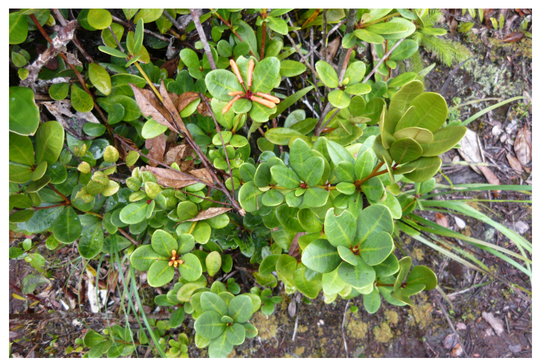
Figure 1. Habit of Rhododendron benomense Rafidah & A.C.Elliott.

Proposed IUCN conservation category. Vulnerable (VU D2) (IUCN Standards and Petitions Subcommittee, 2019). Several scattered populations were found during a survey of Gunung Benom in 2009 (Ummul-Nazrah et al. , 2011), but no estimate of numbers was made. Although trekking is popular at this location, it has limited impact on the habitat. Gunung Benom, the only known locality of Rhododendron benomense , is part of Krau Wildlife Reserve, which offers some protection. The pressures and threats reported for Krau Wildlife Reserve are focused primarily on the lowland forest area of the reserve (Birdlife International, 2021), not the summit of Gunung Benom where this species occurs. The restricted distribution (area of occupancy c.8 km<sup>2</sup>, based on summit area above the minimum recorded altitude) and the presumably small size of the population (fewer than