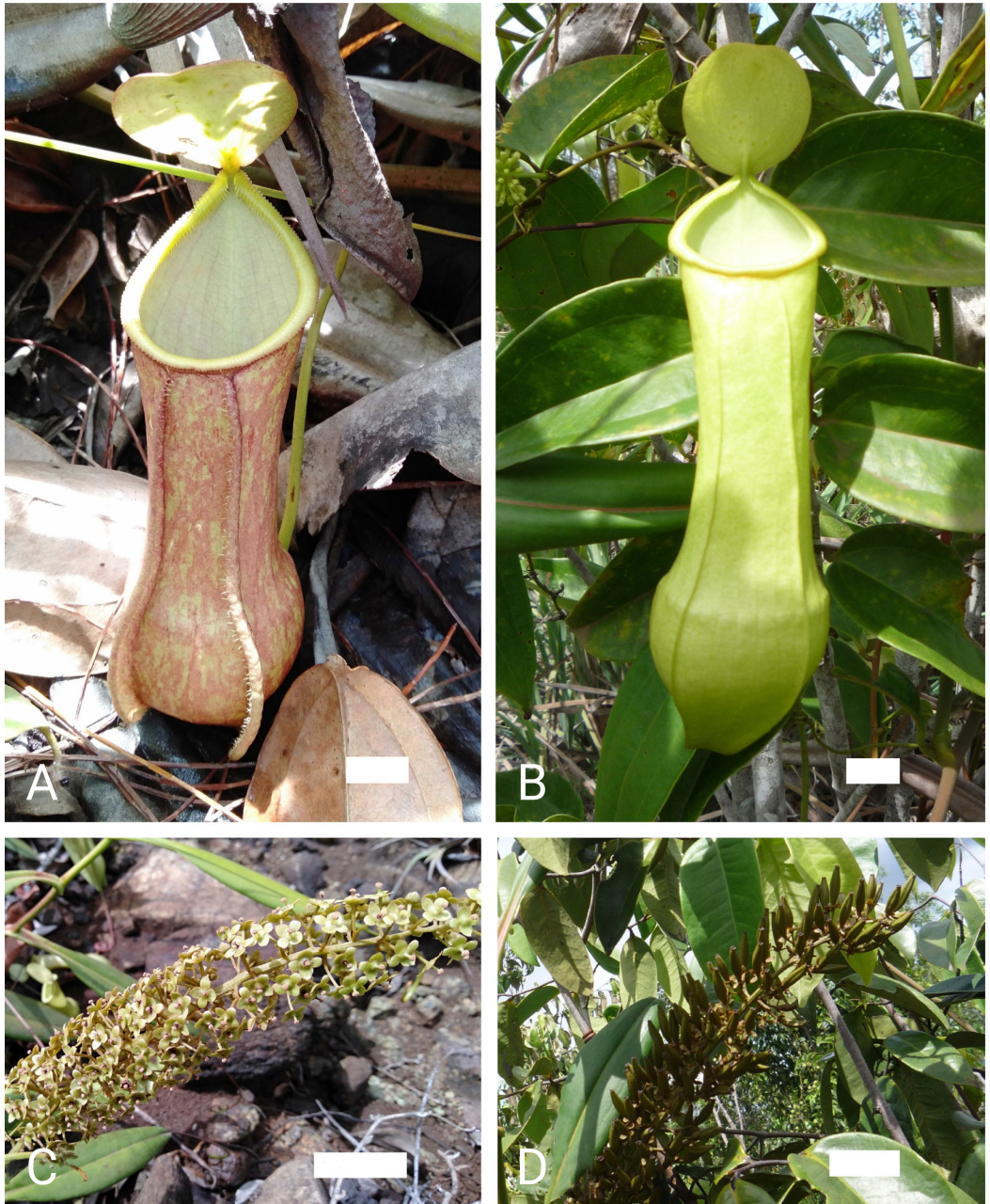
Figure 1. Nepenthes weda at Weda Bay, Halmahera, Indonesia: A, lower pitcher; B, upper pitcher; C, male flowers; D, fruit. Scale bars (approximate): A and B, 1 cm; C, 2 cm; and D, 5 cm.