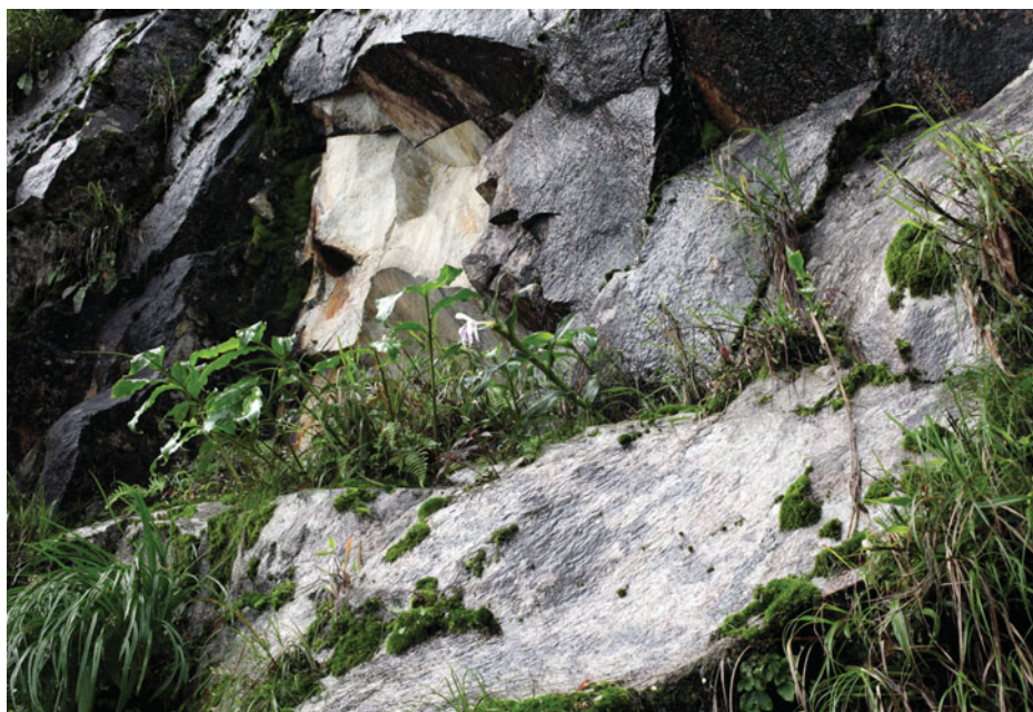
FIG. 2. Roscoeia megalantha at the type locality, habitat. (Photograph by T. Yoshida, 8 July 2014.)

somewhat shaded by adjacent rocky cliffs or trees; rooting into humid blackish soil among rocks with other herbs, mosses and ferns, below 3500 m altitude.