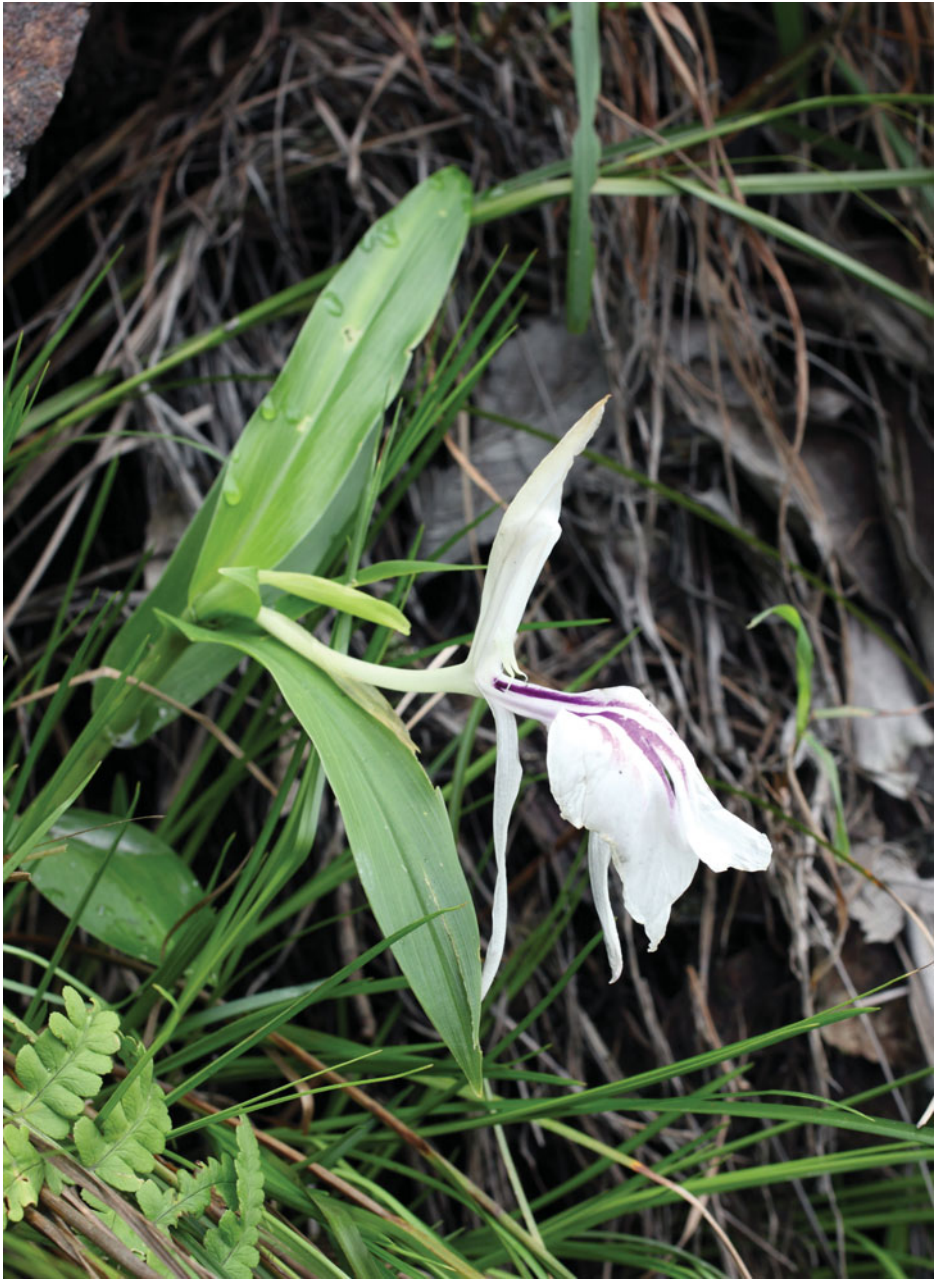
FIG. 1. Roscoea megalantha at the type locality, whole plant. (Photograph by T. Yoshida, 27 June 2014.)